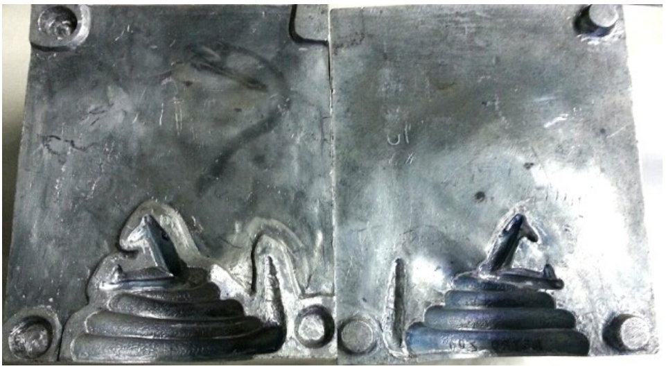
The RATTLESNAKE moldset was made in the early 1990s. It is UNnumbered because it was made long after the Mold-A-Rama, Inc. era of the 1960s when they serial-numbered most of their moldsets. While it was initially used at Gatorland, the RATTLESNAKE moldset was also run at Central Florida Zoo, and most recently at Miami Metro Zoo.