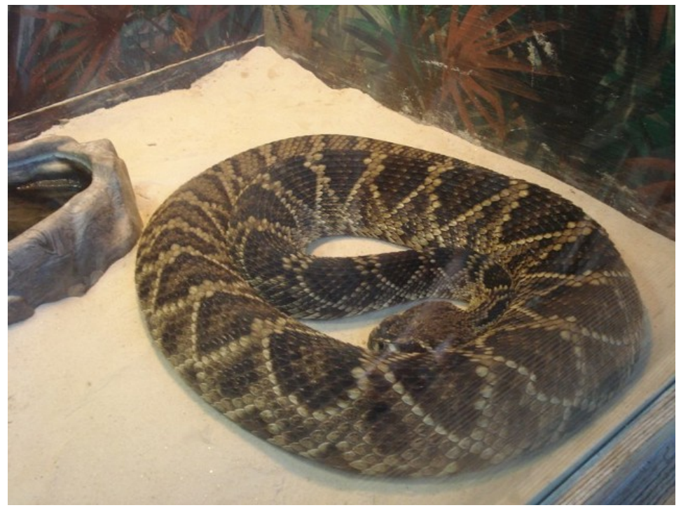
Eastern Diamondback Rattlesnake at Gatorland