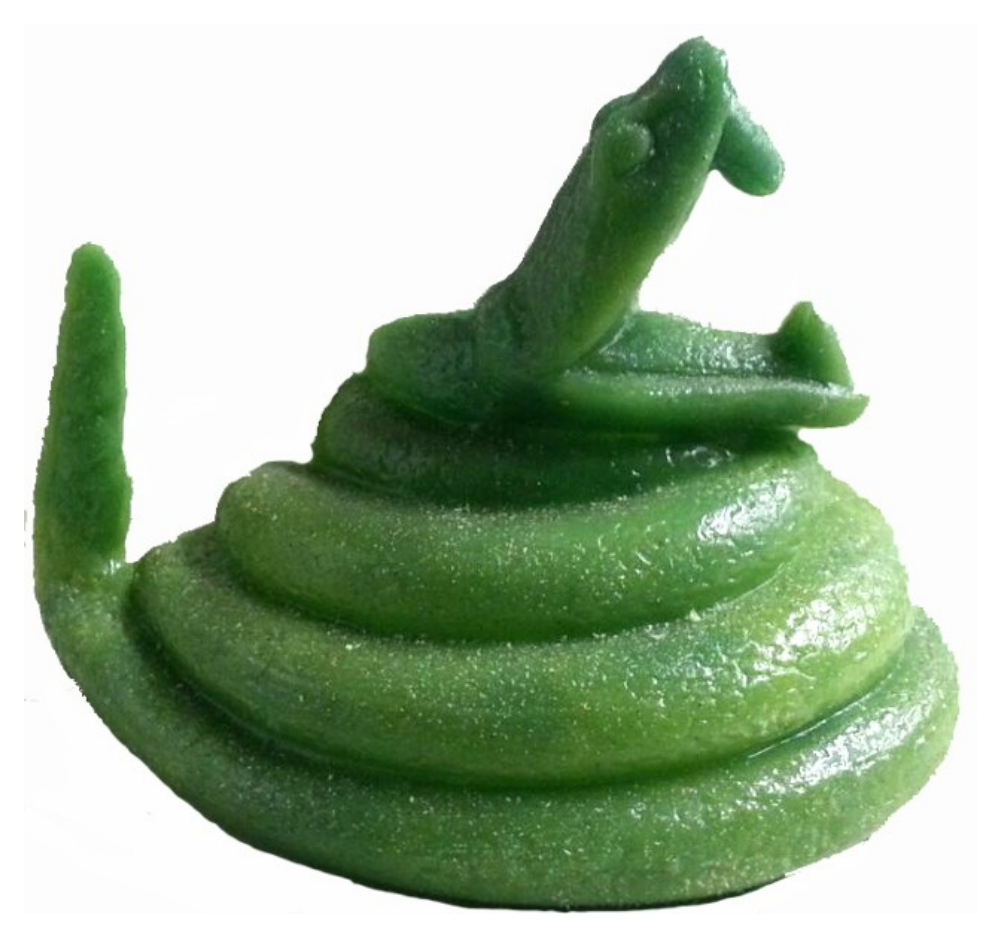
Disclaimers: The color and/or exact condition of the MOLD you get in the CLUB-A-RAMA may or may not be as shown. Not for children under 3.

Please visit the facebook page called 'Moldville', and 'LIKE' it, to keep up to date: <u>http://www.facebook.com/pages/MOLDVILLE/156515454416041?success=1</u>