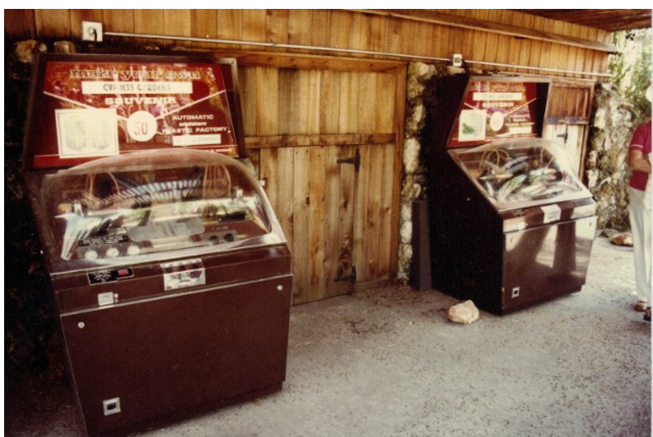
MOLD-A-MATIC machines at Cypress Gardens during the 50c era (c1970s).