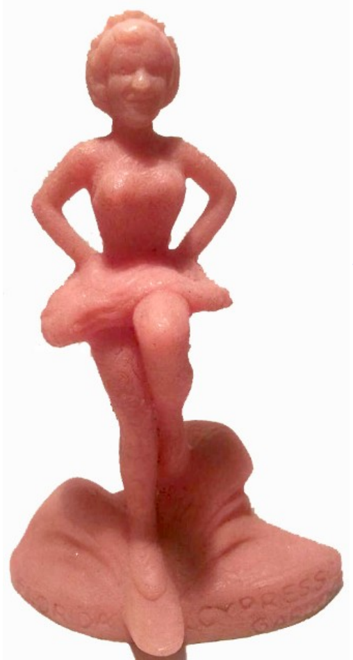
This is a vintage WATER SKI GIRL from Cypress Gardens.

Cypress Gardens as we knew it closed in April 2003. It briefly reopened in late 2004 as Cypress Gardens Adventure Park, but filed Chapter 11 in 2006, and continued to struggle until it closed for good in 2009.