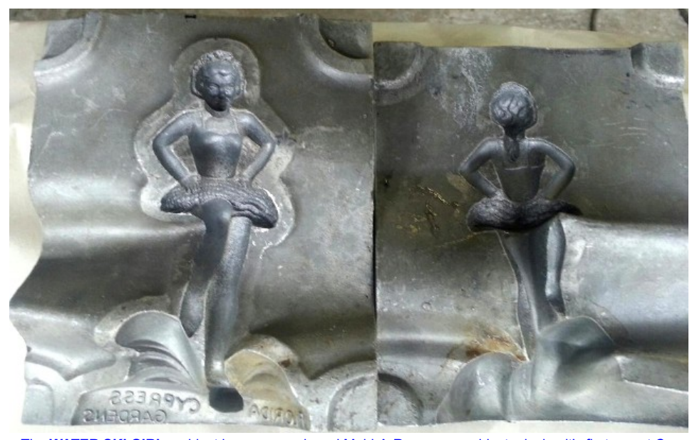
The WATER SKI GIRL moldset is an un-numbered Mold-A-Rama era moldset, placing it's first use at Cypress Gardens probably around 1968, though it could have been as early as 1967 and as late as 1970. There is only one moldset of the WATER SKI GIRL - and this is it!

In October 2011, Legoland Florida opened on the site of the former Cypress Gardens.