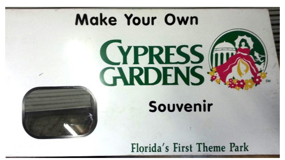
A "later-model" plexi backglass for the MOLD-A-MATIC machines from late 1990s to 2000 at Cypress Gardens.