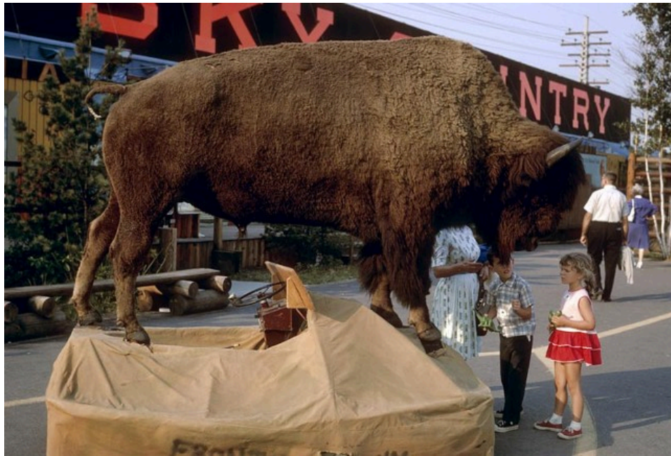
This is one of my favorite photos from the New York World's Fair, dated August 1965, courtesy of Bill Cotter, not only because it shows a buffalo at the MONTANA PAVILION, but because of what the little boy and girl are holding: