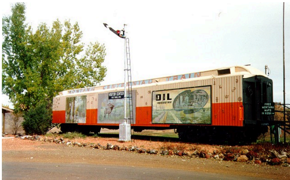
A 30-car Montana Centennial Train, equipped with four exhibit cars, traveled through Montana in February 1964, and then in the spring journeyed to New York City where it was on display in the Montana Pavilion of the 1964 New York World's Fair.