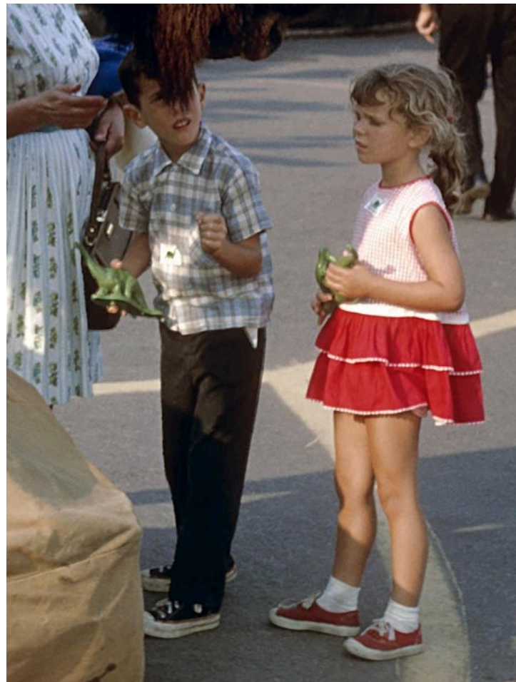
In 1961 the Montana Territorial Centennial Commission was created as a special department of the Montana state government for "the sole purpose of providing a dignified, significant celebration during the full year of 1964 commemorating creation of the territory as well as honoring 75 years of statehood by and for the people of Montana." An appropriation of $200,000 was approved for the state-wide celebration. In addition, a campaign to raise funds from private sources was also instigated and a quota system established that requested each county to donate "a nickel per capita" (i.e., five cents for each resident.)