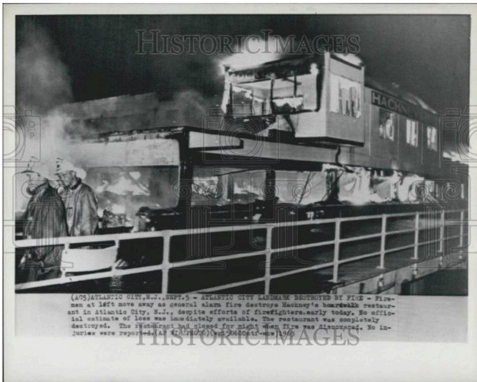
(A05)ATLANTIC CITY,N.J.,SEPT.5 - ATLANTIC CITY LANDMARK DESTROYED BY FIRE - Firemen at left move away as general alarm fire destroys Hackney's boardwalk restaurant in Atlantic City, N.J., despite efforts of firefighters early today. No official estimate of loss was immediately available. The restaurant was completely destroyed. The restaurant had closed for night when fire was discovered. No injuries were reported. (AP Wire Photo) (AP Wire Photo) - 1963

Week after week MOLDVILLE.com reissues a souvenir from a location that has since been lost to time, and this week is no exception. Though they rebuilt after the September 1963 fire, Hackney's Restaurant (as well as Capt. Starn's Seafood Restaurant) are both now but a memory from years past on the Boardwalk in Atlantic City.