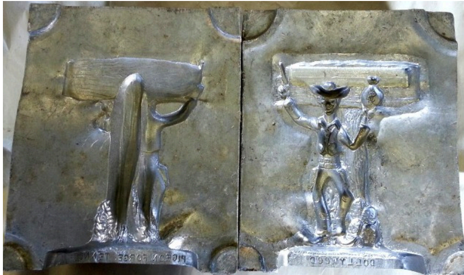
The COWBOY WITH MONEY BAG moldset is UNnumbered, but is identical to the numbered moldset originally made for FUN-TIER TOWN (which is number 1055, dating to 1963). The COWBOY WITH MONEY BAG that Club-A-Rama members will receive is engraved "DOLLYWOOD" on the front and "PIGEON FORGE TENN" on the backside.