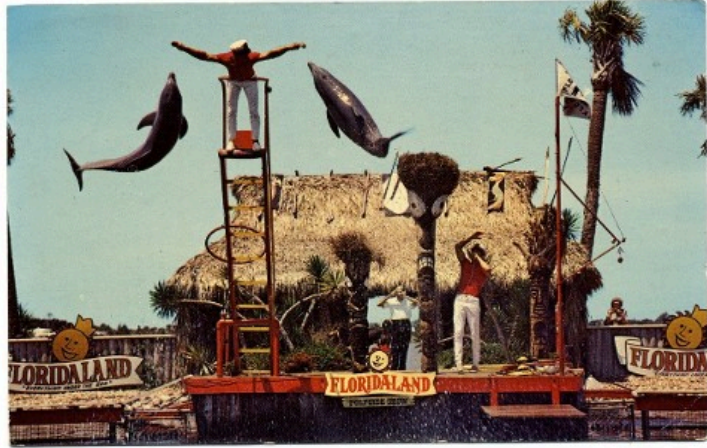
FLORIDALAND even had a porpoise show, and a petting zoo.