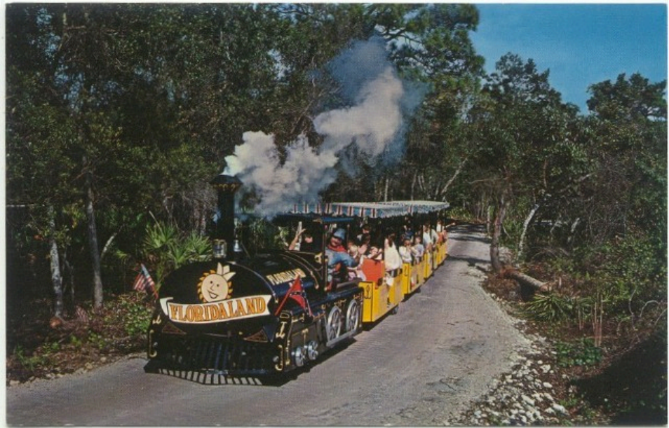
Tourists could ride around the whole park on a tram made to look like a western train.