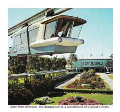
Where is the Seaquarium Monorail today you might ask? Well, it met its demise in 1991, when track demolition was started to make way for a park expansion that did not include the monorail. Rumor has it that the old monorail cars are today being used as sheds.