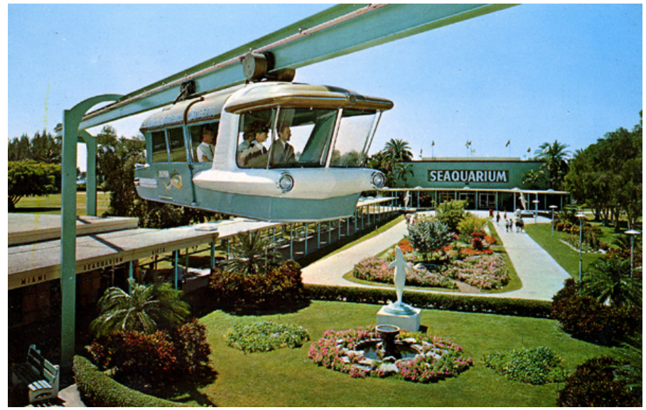
Constructed in 1963, the Miami Seaquarium Monorail was billed as the first of its kind on the East Coast. Suspended on a 2385 foot long guideway, five cars (with one in reserve) carried guests on a 6 mph trip past show and exhibit buildings. The original cars were each named for a fish and had operating headlights and air conditioning.