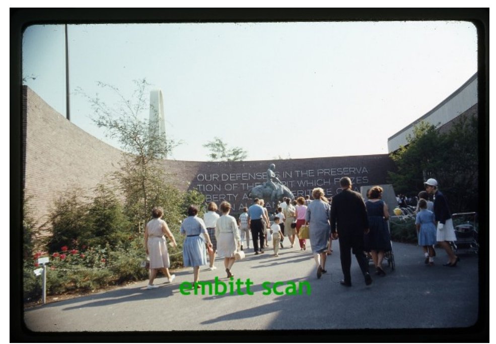
As discussed in week 24 of v1.0 of MOLDVILLE's Club-A-Rama, it wasn't known until very late that the show at the Illinois Pavilion would star only Mr. Lincoln. It was originally intended to be a show called "ONE NATION UNDER GOD" in which ALL of America's presidents would have been featured. But because of the delays in development of the animatronics, only Mr. Lincoln was ready.