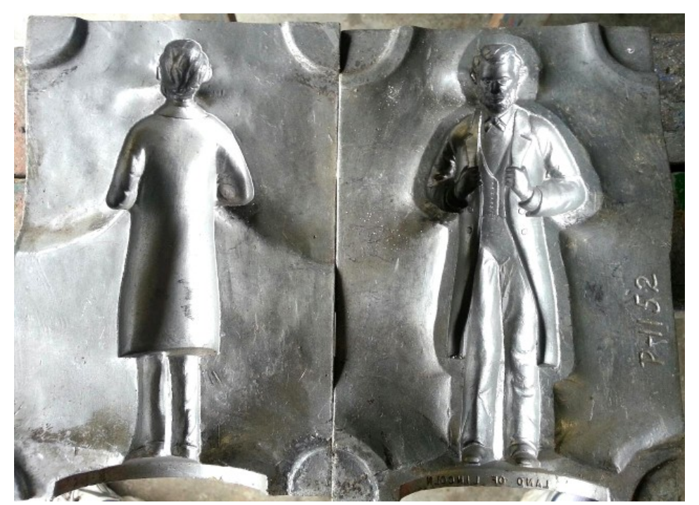
The STANDING LINCOLN is serial numbered 1152, which places it solidly for use in only the SECOND year of the New York World's Fair, i.e., 1965.

Disclaimers: The color and/or exact condition of the MOLD you get in the CLUB-A-RAMA may or may not be as shown. Not for children under 3.