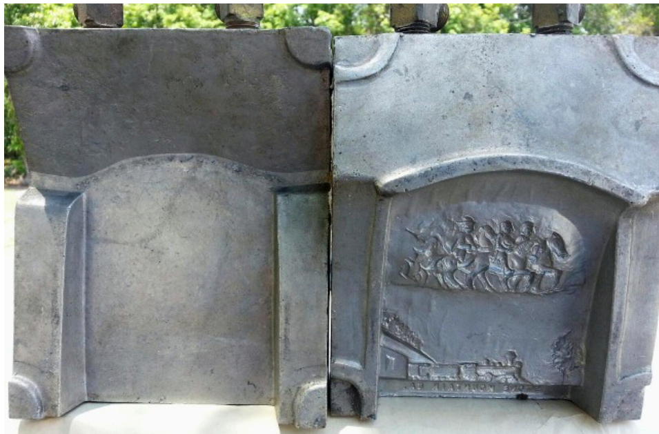
The STONE MOUNTAIN moldset is UNnumbered from the Mold-A-Rama era, dating its creation generally to 1967-1969.