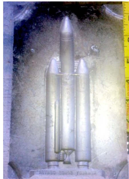
Above is an original moldset of the TITAN IIIc MISSILE . Two originals exist in private hands. This week's reissued TITAN IIIc MISSILE was made from a copy of the original moldset, shown below: