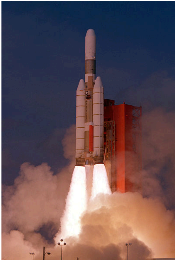
The Titan rocket family was established in October 1955. Titan I was the nations first two-stage inter-continental ballistic missile (ICBM). The Titan IVb was the last Titan rocket to remain in service, making a second-to-last launch from Cape Canaveral on April 30, 2005, followed by a final launch from Vandenberg Air Force Base on October 19, 2005.