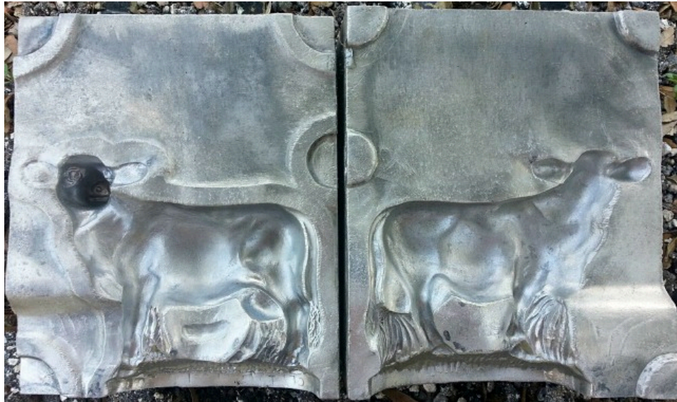
The COW mold was made long after the original MOLD-A-RAMA era.

Disclaimers: The color and/or exact condition of the MOLD you get in the CLUB-A-RAMA may or may not be as shown. Not for children under 3.