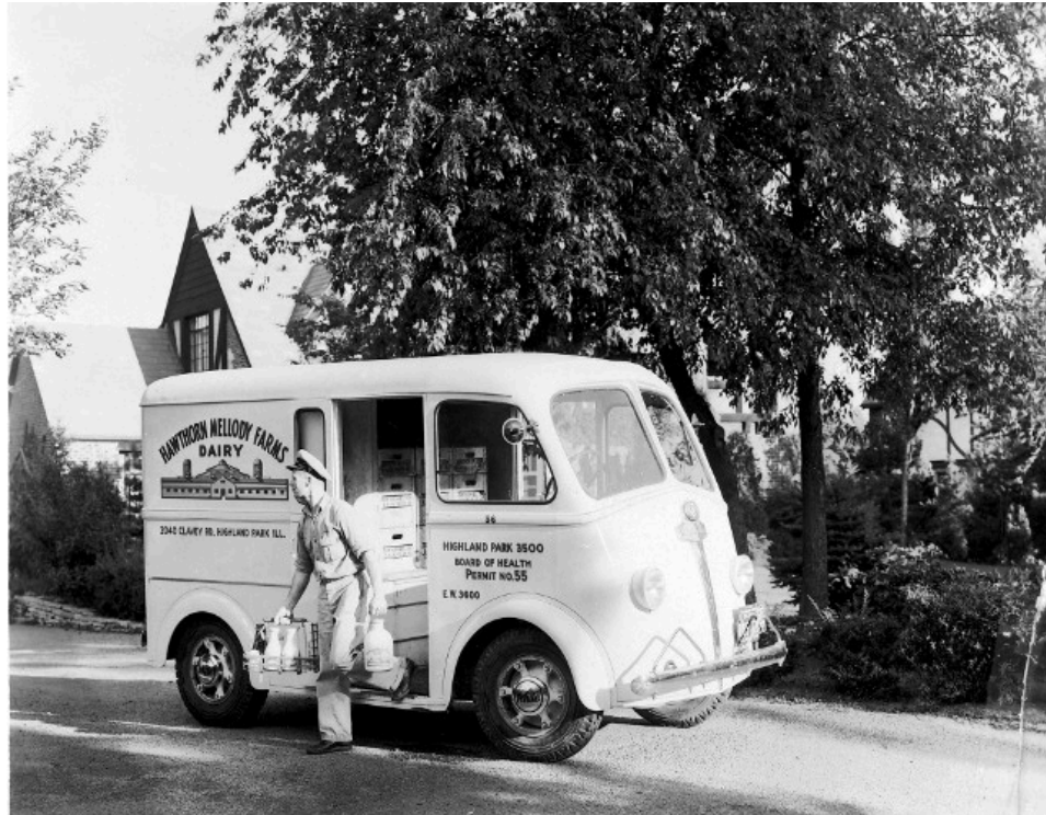
A Hawthorn-Mellody Farms milk truck man delivering milk to Highland Park residents.

The COW has also been run at Lowry Park Zoo; Imagination Station for their farm exhibit last summer.; and at the Central Florida Zoo.