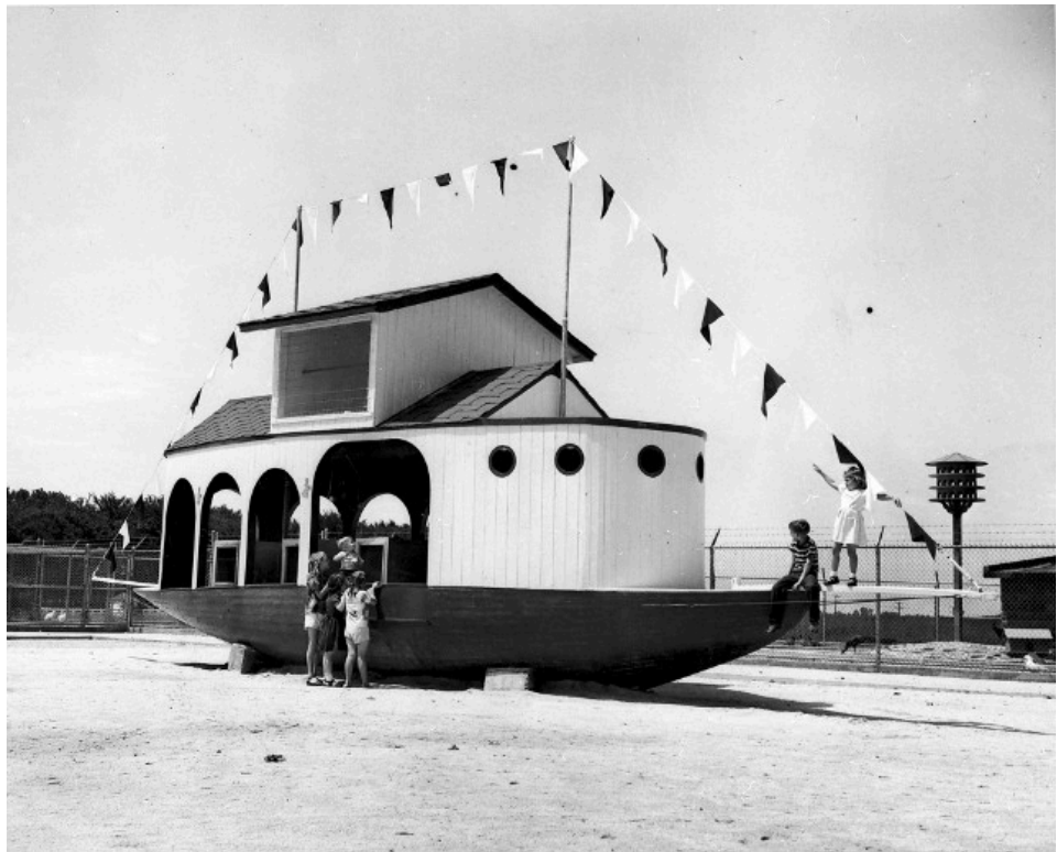
Noah's Ark at Hawthorn-Melody Farm's Amusement Park.