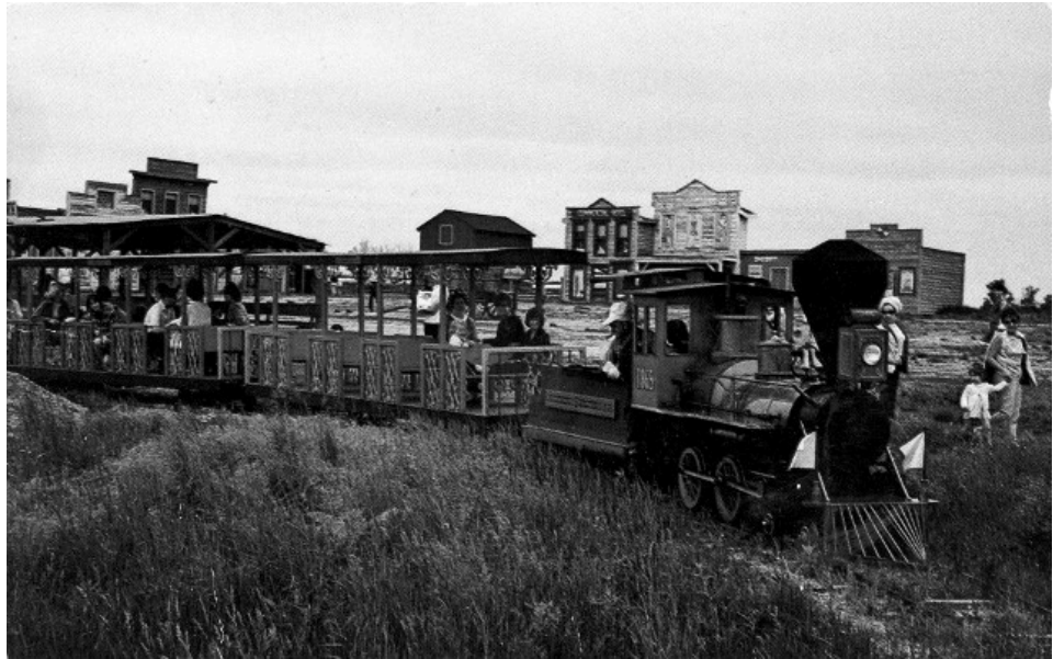
The steam train running through the amusement park of Hawthorn-Melody Farms.