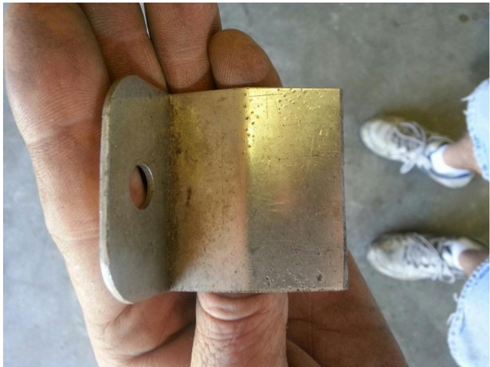
Did I mention that this original moldset is HUGE? It is so so massive that a shortened shovel had to be made to fit. Moldville has this original short shovel from a BRONTOSAURUS (looking backwards) machine.