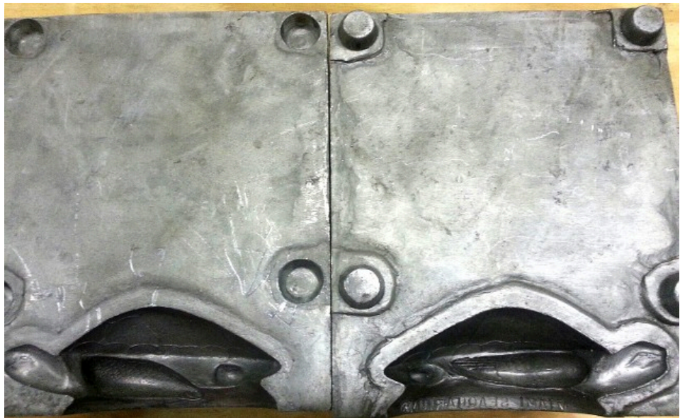
The SEA TURTLE moldset was made in the 1990s. It has been run at the Miami Seaquarium, and also at Lowry Park Zoo.

Disclaimers: The color and/or exact condition of the MOLD you get in the CLUB-A-RAMA may or may not be as shown. Not for children under 3.