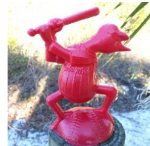
MUDDY MUD HEN