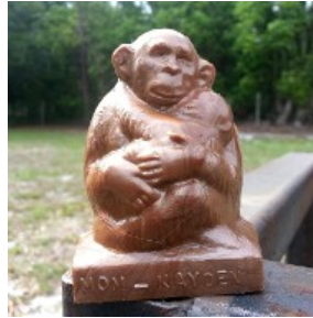
CHIMP & BABY

1967-69 Crandon Park Zoo Key Biscayne, Miami, FL