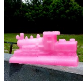
COAL CAR TRAIN