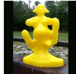
CORKY THE CLOWN

1962 Willow Grove Lanes Willow Grove Amusement Park, PA