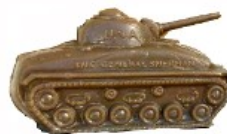
THE GENERAL SHERMAN 1963