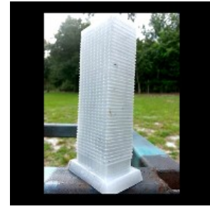
HUMBLE OIL BUILDING