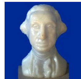
GEORGE WASHINGTON 1964-65 New York World's Fair