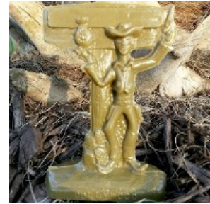
COWBOY WITH MONEY BAG