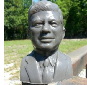
LARGE JFK bust