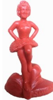
WATER SKI GIRL