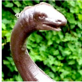
BRONTOSAURUS (looking back)