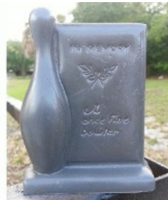
BOWLING PIN PLAQUE

1962 Willow Grove Lanes Willow Grove Amusement Park, PA