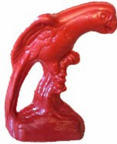
MACAW early 1970s Florida