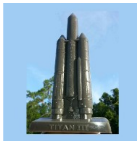
TITAN IIIc MISSILE