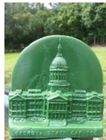
GEORGIA STATE CAPITOL