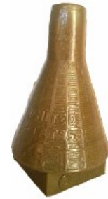
GEMINI SPACE CAPSULE