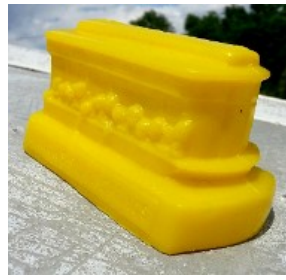
GLASS BOTTOM BOAT

Illinois Pavilion 1965 New York World's Fair