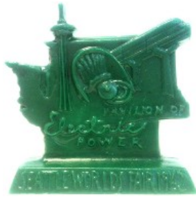
PAVILION of ELECTRIC POWER