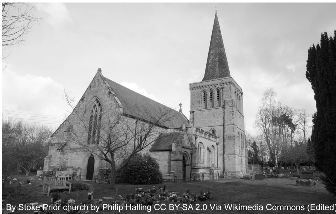
By Stoke Prior church by Philip Halling CC BY-SA 2.0 Via Wikimedia Commons (Edited)

https://maps.nls.uk/geo/explore/#zoom=16.6&lat=52.30537&lon=-2.07494&layers=168&b=1