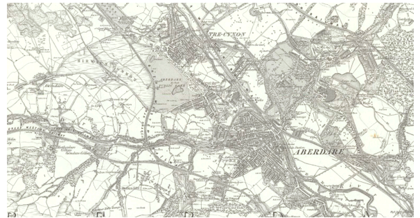
Aberdare showing the railway complex C1868