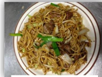
Beef Chow Mein