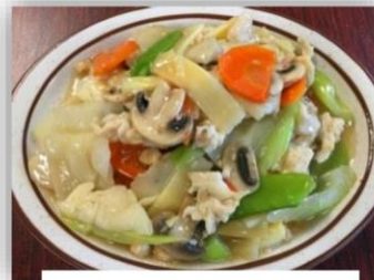
Moo Goo Gai Pan

Steamed tofu stir-fried with onions, peas, and carrots in a spicy dark brown sauce.