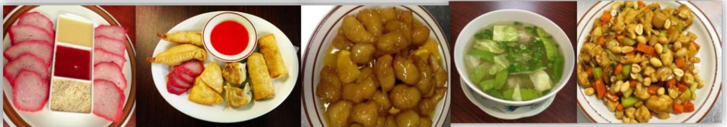
Pork & Seeds