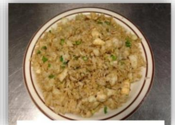
Chicken Fried Rice