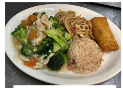
#16 Broccoli Chicken