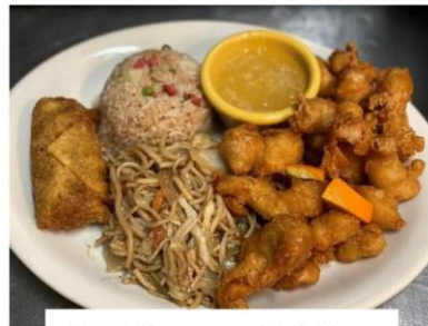
#13 Orange Chicken