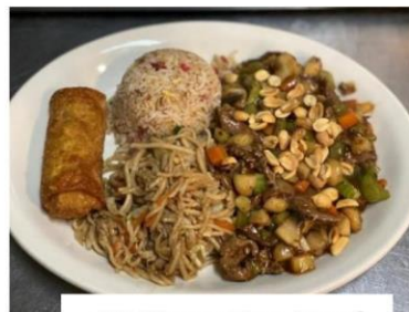
#8 Kung Pao Beef

Our family appreciates your business, thank you for your support. We are celebrating our 10 th year in business and couldn't have done it without YOU!