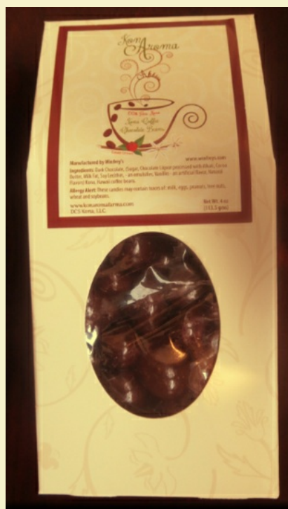
Chocolate Covered KonAroma Beans ORDER FREE SHIPPING