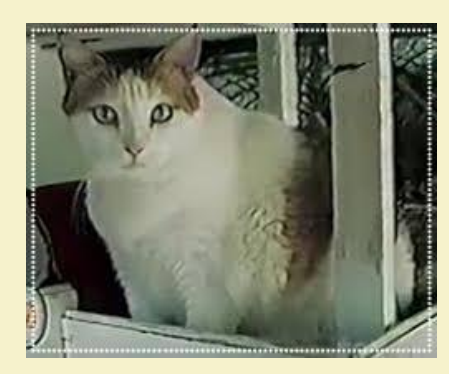
RIP Creme Puff

The record holder for the title "oldest cat ever"-a cat named Crème Puff-lived to be 38 years and three days old. She drank