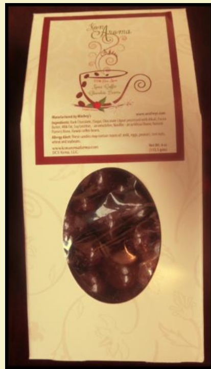
Chocolate Covered KonAroma Beans ORDER FREE SHIPPING

We love to hear from our customers! Kindly, send us comments, pictures or even videos of you enjoying your KonAroma coffee products.