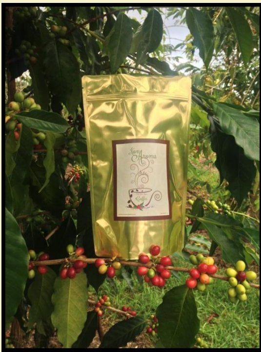
Coffee Beans Whole or Ground ORDER FREE SHIPPING