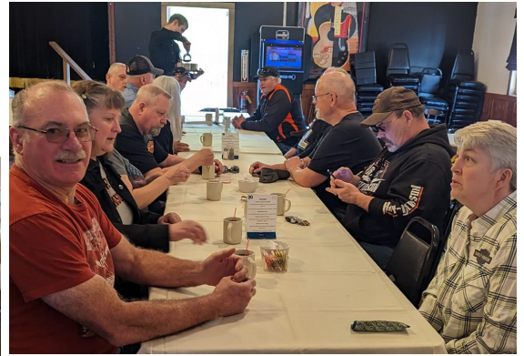
The food was served buffet-style.