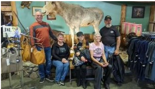
We stopped at L.L. Cote Sports Center 'Toys for Big Boys and Girls' in Errol, NH