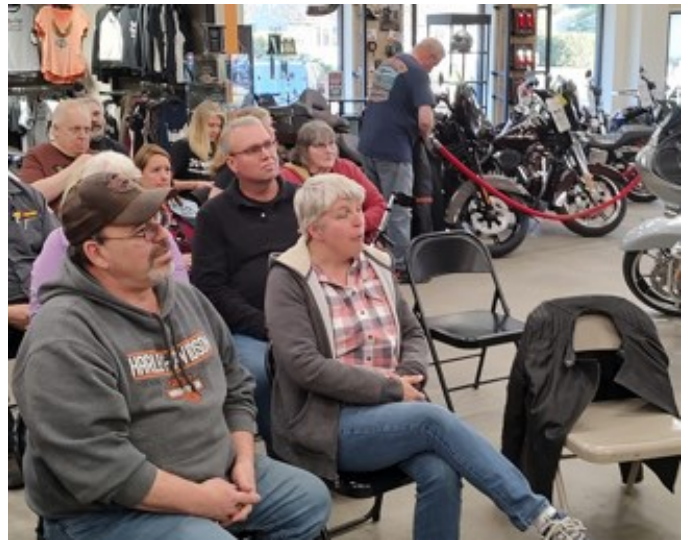
The meeting part of the May Social.