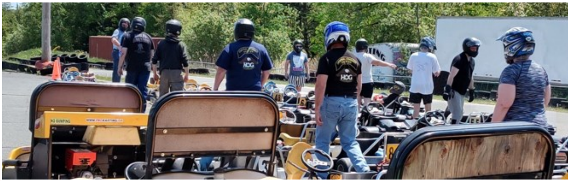
Getting ready to hit the track!