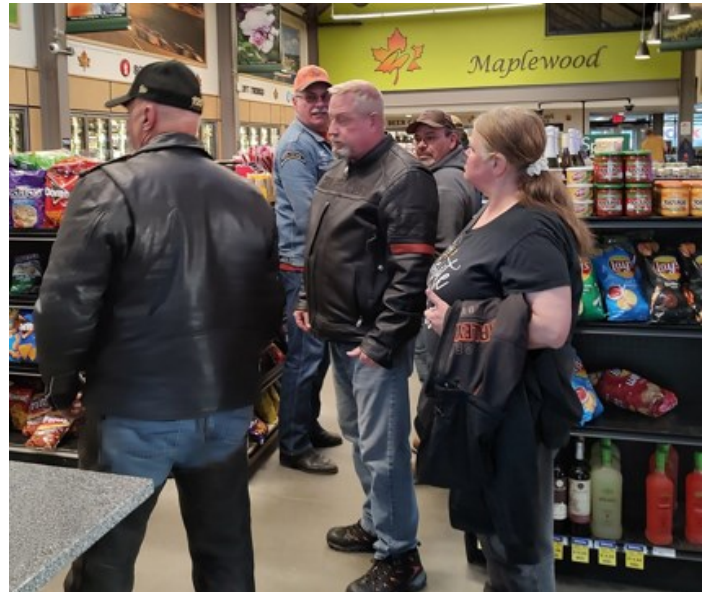
The social part of the May Social!