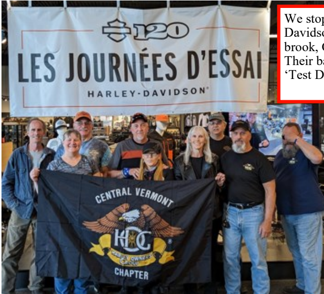
We stopped at Carrier Harley-Davidson Dealership in Sherbrook, Quebec. Their banner advertises their 'Test Days' event.