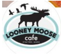
Breakfast at the Looney Moose Café. Their pancakes are massive!