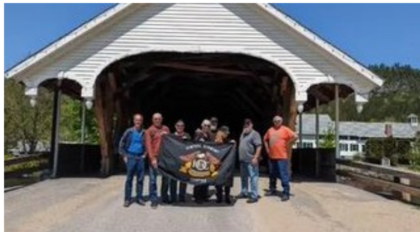
A quick photo op at the covered bridge in Stark, NH