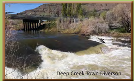
Deep Creek Town Diversion