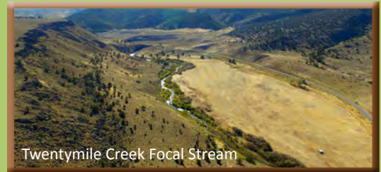
Twentymile Creek Focal Stream