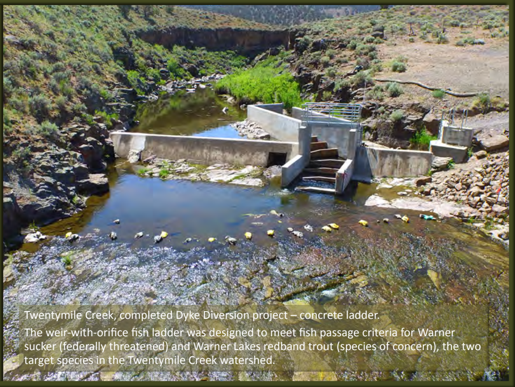
Twentymile Creek, completed Dyke Diversion project – concrete ladder. The weir-with-orifice fish ladder was designed to meet fish passage criteria for Warner sucker (federally threatened) and Warner Lakes redband trout (species of concern), the two target species in the Twentymile Creek watershed.