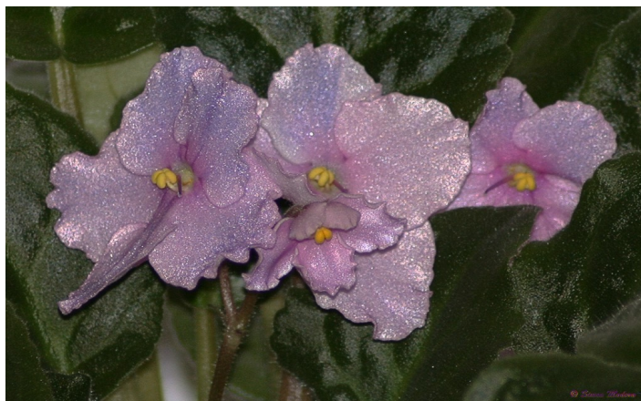
Spring blooms by Simon