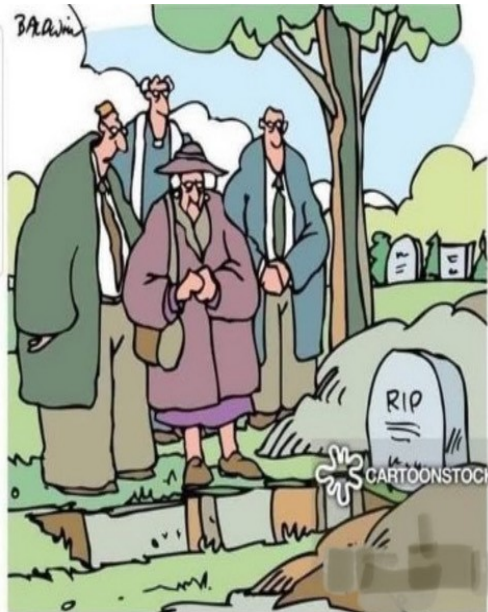
"I'm not climbing down there to fetch your teeth. Serves you right for spitting."