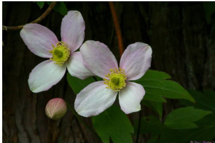
Spring blooms by Simon