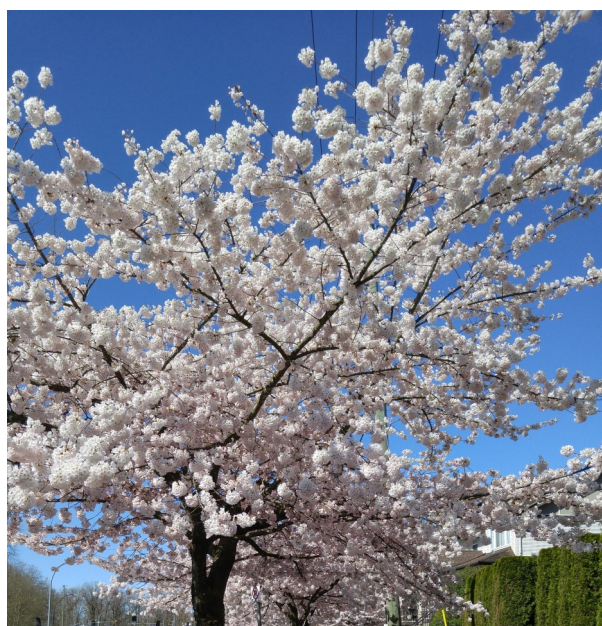
The sign of Spring by Sam