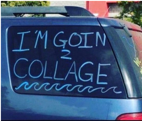
Well, good luck with that...