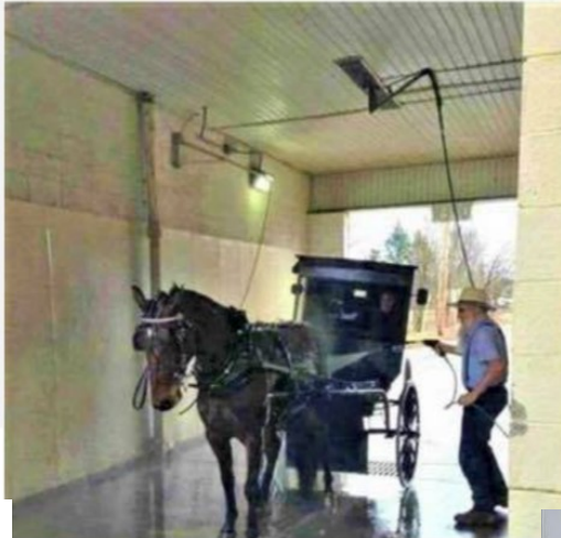
Amish farmer washing his classic Mustang.