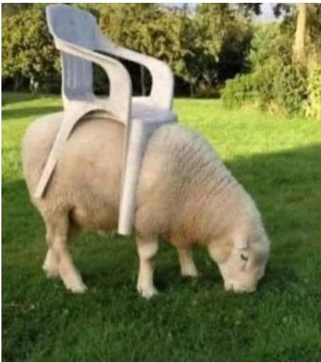
Riding Lawnmower $300