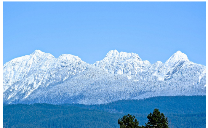
Best Mountains by Sandie