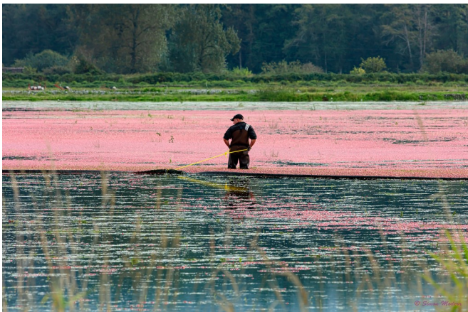
Cranberry Harvest by Simon