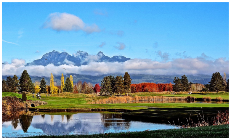
Fall, at the Golf Course