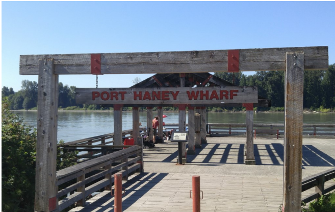
Port Haney Wharf