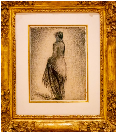
Charcoal Sketch by Georges Seurat