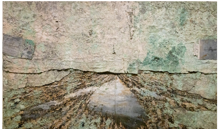
Art Photo - The Land of two Rivers by Anselm Keifer