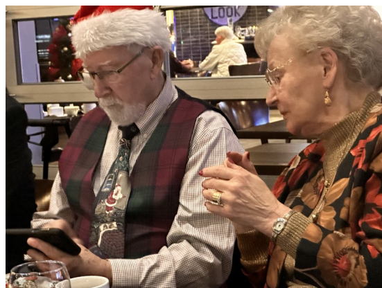
Samta 'checking his list'!

An evening of good food and good company was what was needed—and that was exactly what happened!