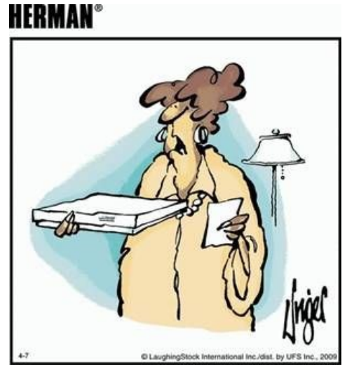
"I don't want to worry you, but the guy who delivered the pizza was your financial planner."