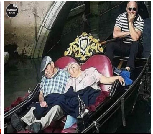
This Is the Reason Why You Should Not Wait Until Retirement:- to Travel!