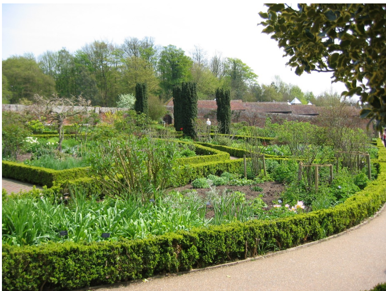
The Culpepper Herb Garden, Leeds Castle, Kent.