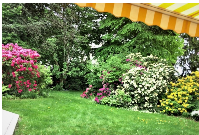
The Garden at 216 by Theo