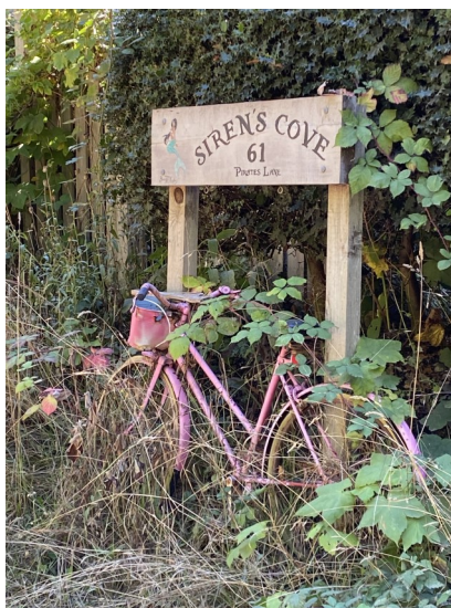
Siren's Cove, Quadra Island by Michaela