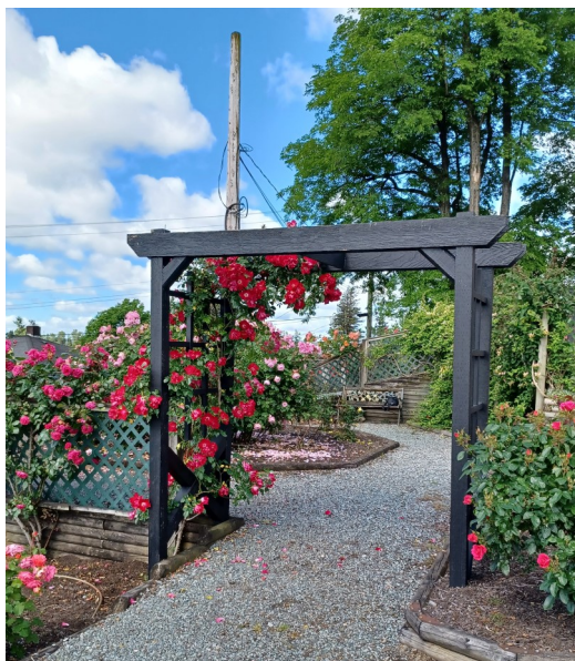
Heritage Park, Mission