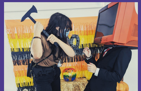
Participants at the COR and Identity, Inc. HalloQueer Carnival, October 2022