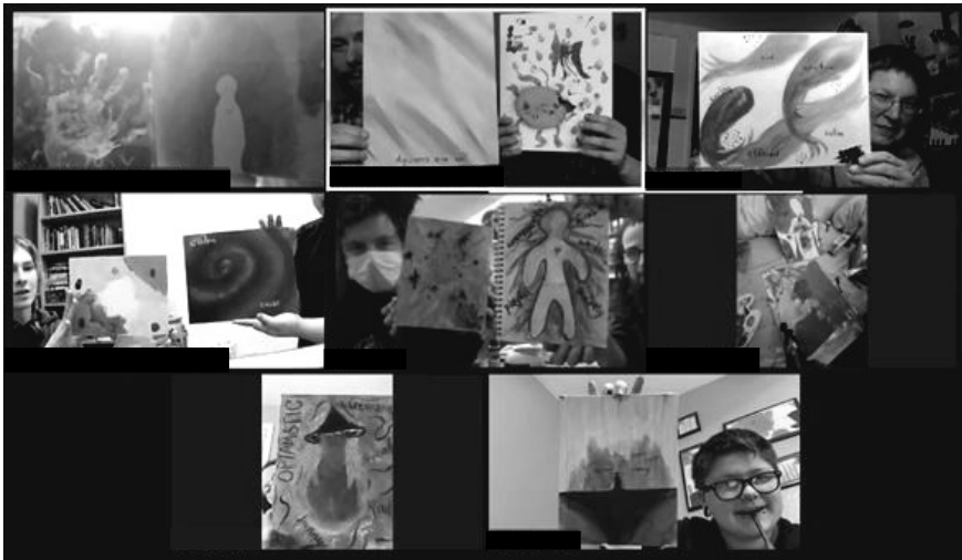
Youth participants led a series of virtual arts events this spring, which fostered mental wellness through creativity and connection. As one young person said, “There is so little community right now that I have access to ... and this felt like a community.” The paintings shown here include self-affirmations, as young people see that they are calm and strong, genuine and kind, alive and resilient!

“This organization just makes me feel so safe.” — COR Youth Leader