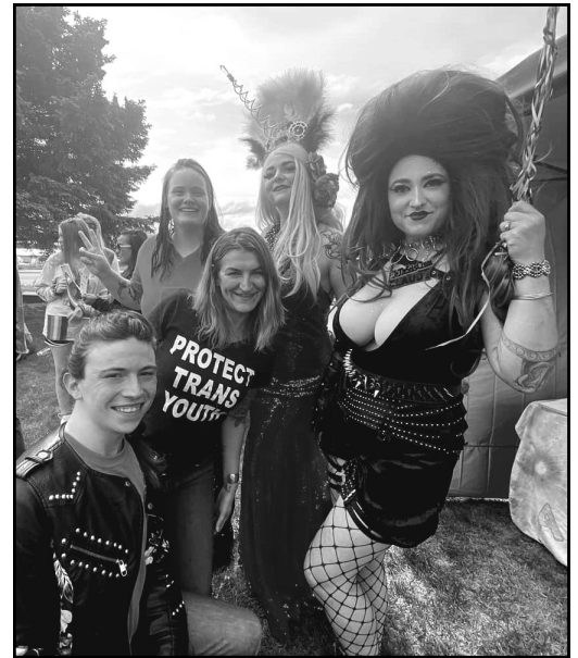
COR youth, staff, and volunteers enjoyed Pride celebrations all over the state—including this one in Homer— and were able to take leadership roles in several of these life-affirming events.

“Before COR, I felt alone. Now I feel like I’m part of a community that really cares about me.” — COR Youth Participant