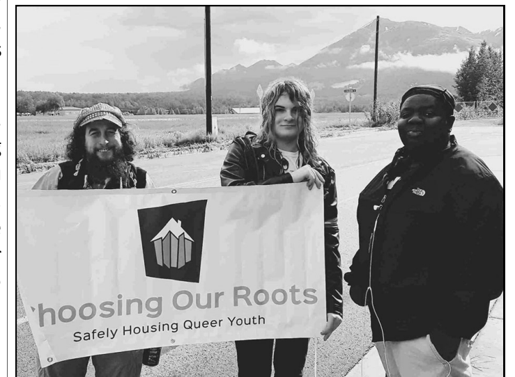
Youth leaders and volunteers representing COR in the Mat-Su Valley. Queer visibility and public advocacy are essential for young people, especially in smaller communities, and many were delighted to see COR marching in the Colony Days parade.