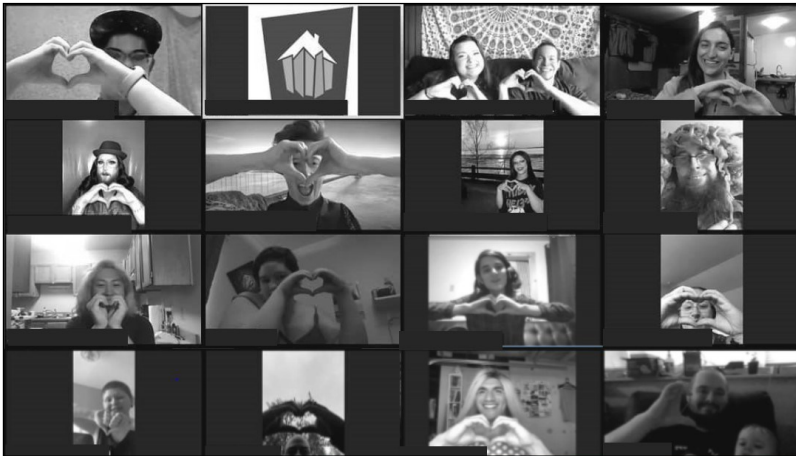
In a time of increased isolation, COR is creating virtual spaces for social support, community building, skill sharing, and queer joy.

“COR truly goes beyond community for me and becomes family... My voice is important, and I wouldn't have known that if I wasn't a part of COR.”