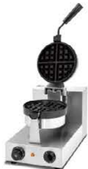
Model: HWB-1A Rotary Waffle Baker