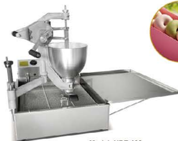
Model: HDF-102 Desktop Hand Wave Electric Donut Fryer