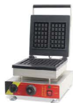
Model: HWB-2C Waffle Maker