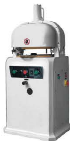
Model: FK-30A Fully-auto Rounder & Divider