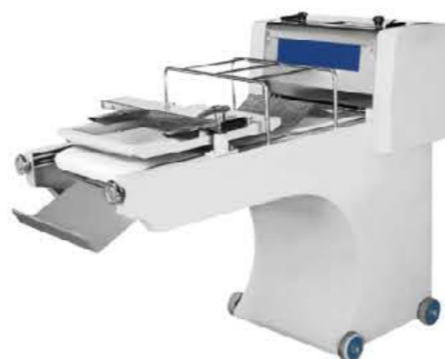
Model: CG-38 Dough Moulder