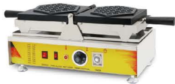
Model: FCS-2E Egg Waffle Maker