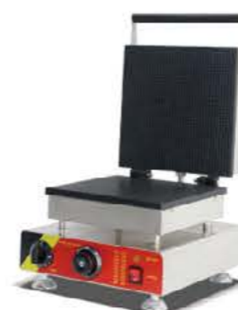
Model: BW-223 Cone Baker Machine