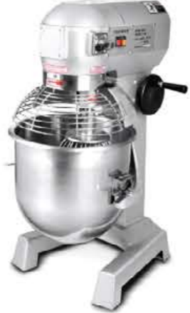
Model: B20B/B30B Food Mixer