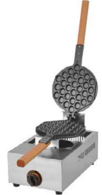
Model: HGG-30 Gas Egg Waffle Baker