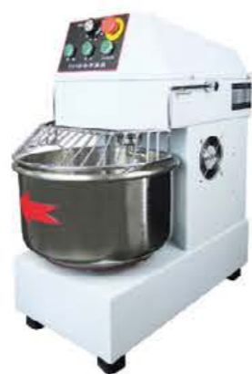
▲ FHS40A Frequency Conversion Dough Mixer