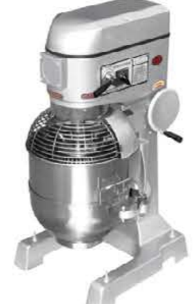
Model: B25B/B40B Food Mixer