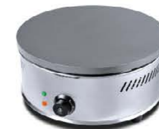
Model: HCM-400 1-Plate Electric Crepe Maker