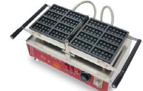
Model: FCS-8W Waffle Maker