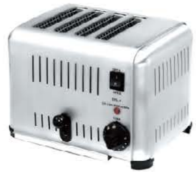
Model: HET-4 4-Slice Toaster