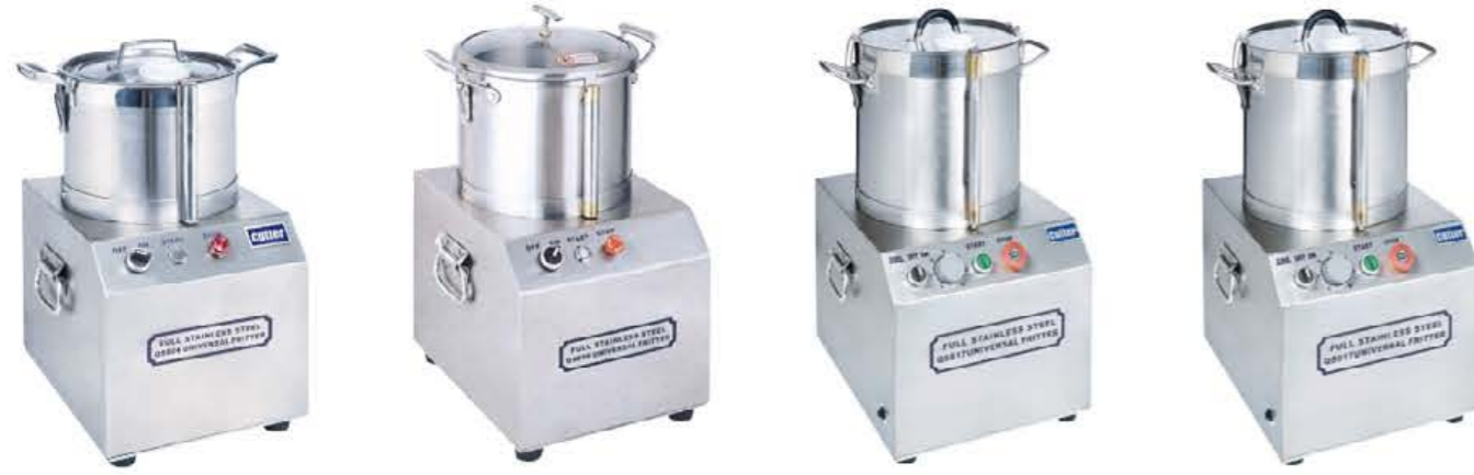
FQS-4L FQS-6L FQS-10L FQS-15L