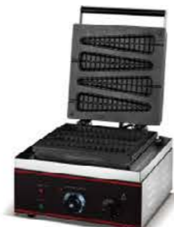
Model: ZH-118B Electric Lolly Waffle Baker