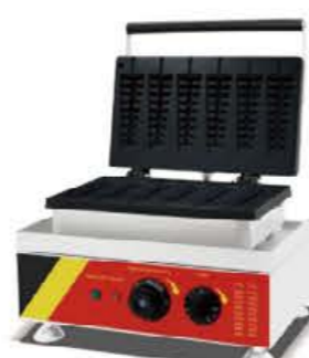
Model: ZH-118D Big Lolly Waffle Baker