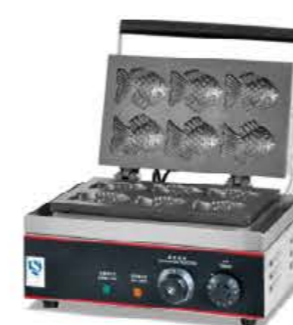
Model: BW-226 Korean fish crisp maker