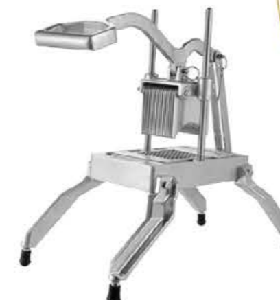
Model: JG-13 Easy Onion Slicer