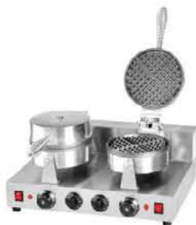
Model: HWB-2 2-Plate Waffle Baker