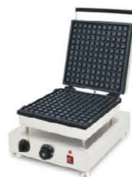
Model: HWB-111 1-Plate Waffle Maker