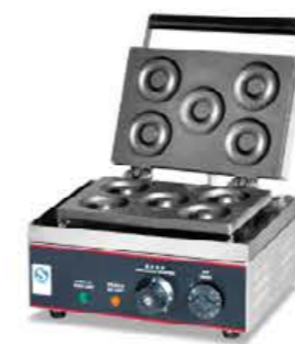
Model: HDM-5 Donut Maker