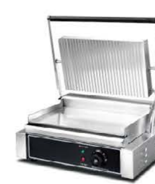
Model: HET-815 HET-815A (All Grooved) Electric Contact Grill