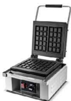
Model: HWB-2B Waffle Baker