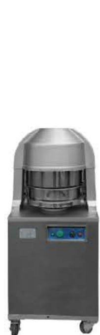
Model: DD36 Dough Divider