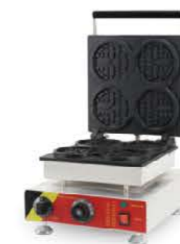
Model: HWB-4T Smile face waffle maker