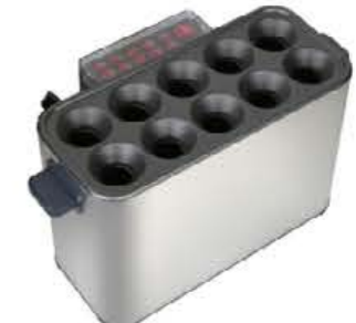
Model: EES-10 / GES-10 Electric / Gas Egg-Sausage Fryer