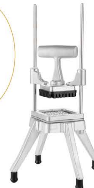
Model: JG-14 Vegetable Cutting Machine/Butyl