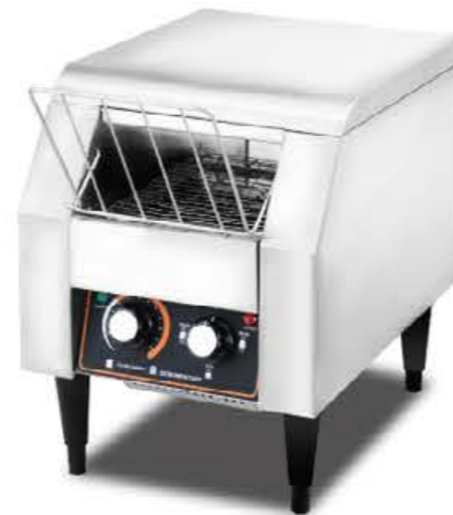
Model: HET-150 / 300 / 450 Electric Conveyor Toaster