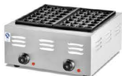
Model: HX-56 Electric 2-Head Fishball Grill