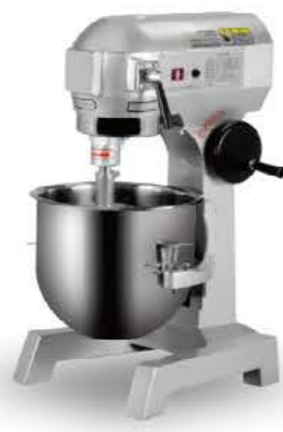
Model: B20S/B30S Food Mixer