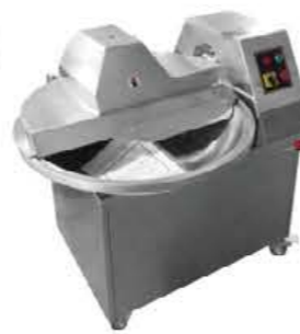
Model: QS-630/QS-650 Food Cut Up Machine(SS body)