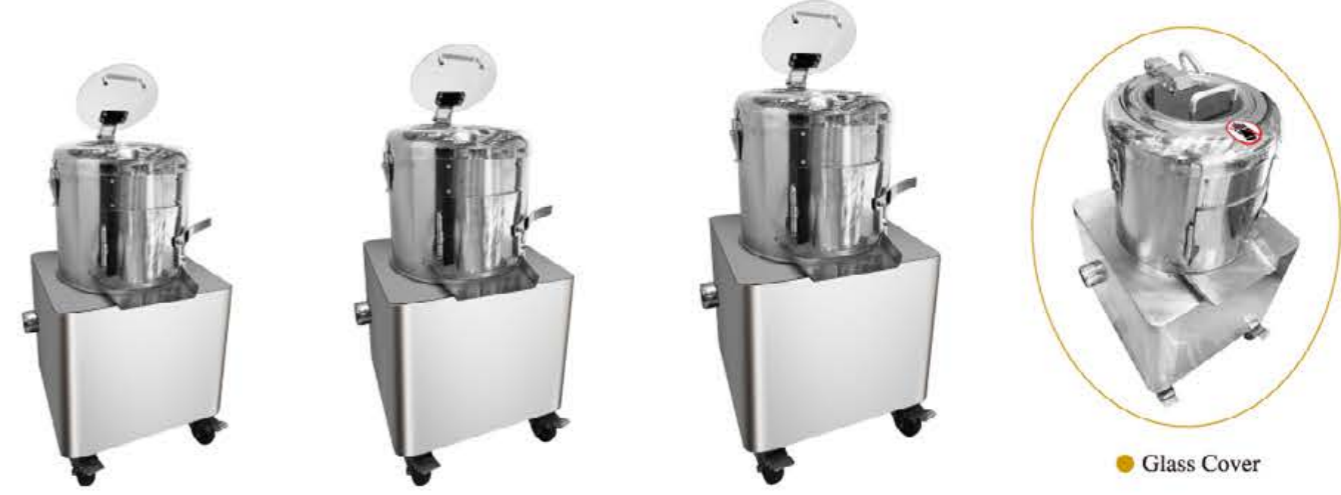
Model: PP8 Model: PP15 Model: PP30 Potato Peeler Potato Peeler Potato Peeler