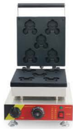
Model: HWB-5B Mickey waffle maker