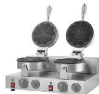
Model: HWB-2H 2-Plate Heart Shape Waffle Baker