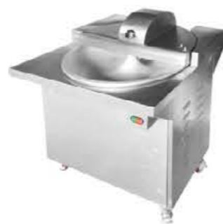
Model: QS-620(Painting) QS-620A(SS body) Food Cut Up Machine