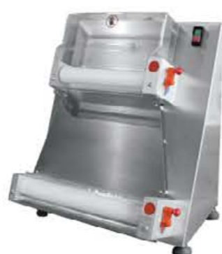
Model: APD40 (Semi-Automatic) Pizza Dough Sheeter