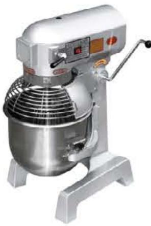
Model: B10B/B15B Food Mixer