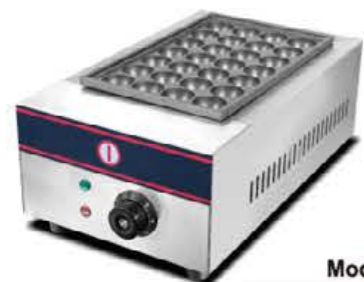
Model: HX-34 Electric 1-Head Fishball Grill