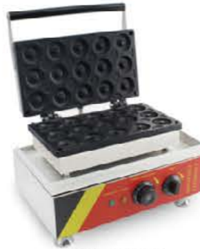
Model: BW-304 Donut machine