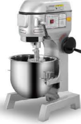
Model: B25F/B40F Food Mixer