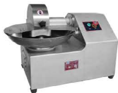
Model: TQ-8(Painting) TQ-8A(SS body) Food Cut Up Machine