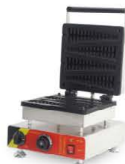
Model: ZH-118C Lolly Waffle Baker