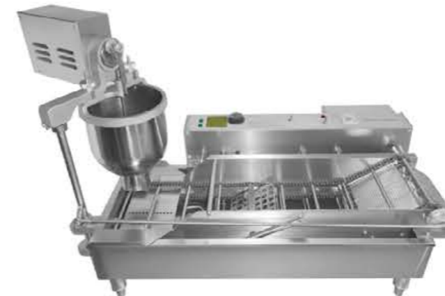
Model: HDF-1400 Auto Electric Donut Fryer