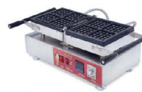
Model: FCS-4W Waffle Maker