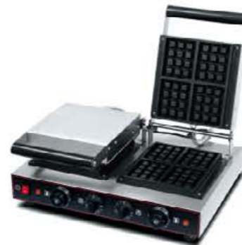
Model: HWB-2S 2-Plate Waffle Baker