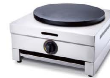
Model: HCM-1G 1-Plate Gas Crepe Maker