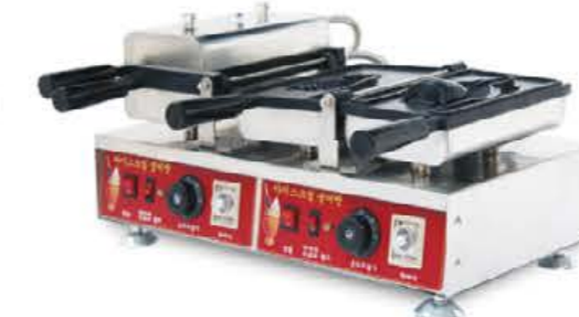
Model: FCS-1102B Commercial taiyaki machine big fish waffle maker