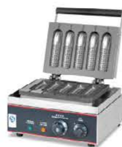
Model: EG-5B Corn crisp maker