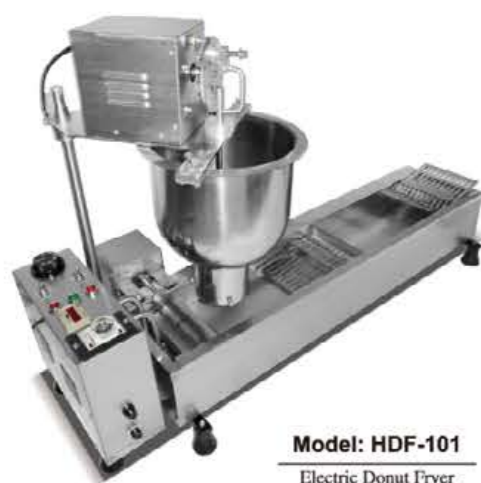
Model: HDF-101 Electric Donut Fryer