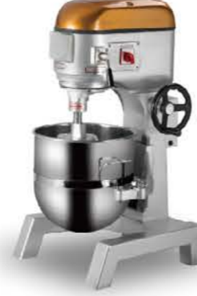
Model: B50F/B60F Food Mixer