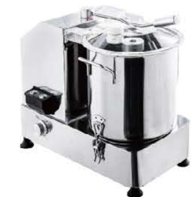
Food Cutting Machine