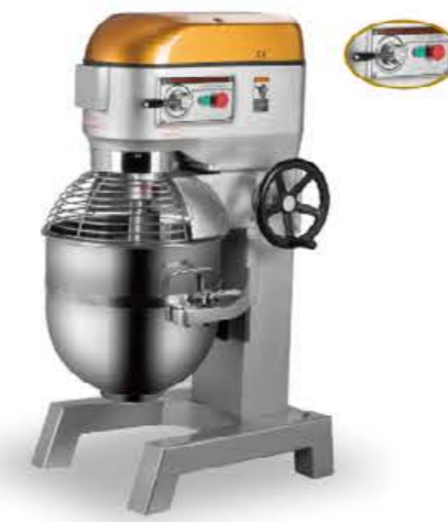
Model: B25K/B40K/B50K/B60K Food Mixer