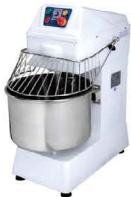
▲ HS50/HS60 Spiral Mixer