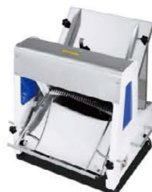
Model: TR31 Bread Slicer