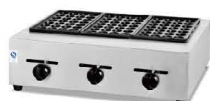
Model: HX-65R Gas 3-Head Fishball Grill