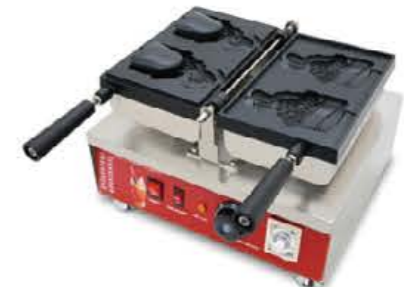
Model: FCS-1102S Ice cream Taiyaki machine