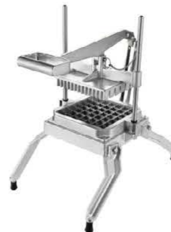
Model: JG-12 Cut The Lettuce, Dicing Machine