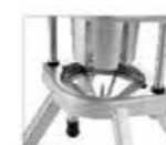
Model: JG-15 Fruit Block Machine