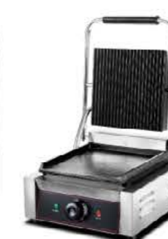
Model: HEG-811A (Down Flat) HEG-811EA (Down Flat) Electric Contact Grill