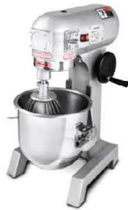
Model: B10S/B15S Food Mixer