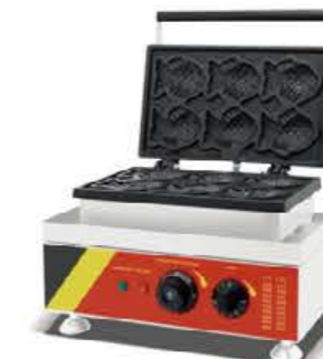
Model: BW-229 Fish Waffle Maker