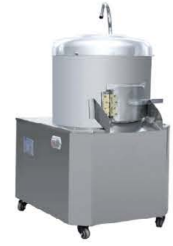
Model: QP-350/500/800 Potato Peeler