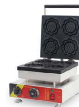
Model: HWB-4F Bowl shape cone waffle maker