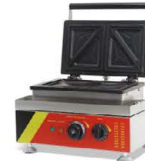
Model: BW-302 4 Slice sandwich waffle maker