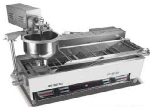
Model: HGF-100B Gas Donut Fryer