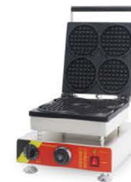
Model: HWB-120 Waffle Maker