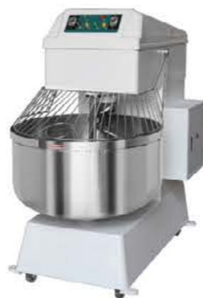
▲ HS80/HS100/HS130 Spiral Mixer