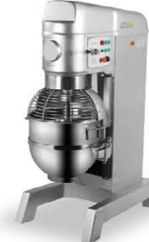
Model: B80K Food Mixer