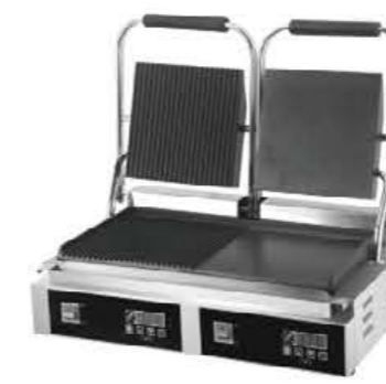
Model: HEG-813T Electric Contact Grill (Touch-Screen Control)