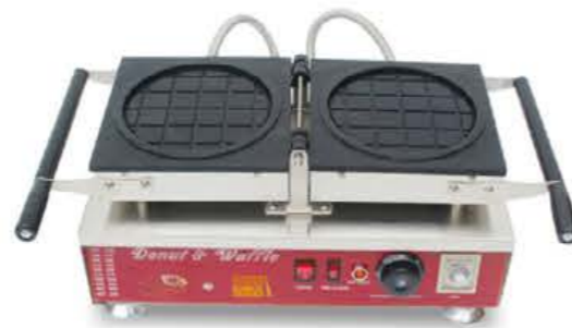
Model: FCS-2R Electric Flip Waffle Maker