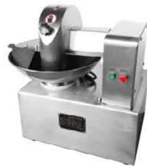
Model: TQ-5(Painting) TQ-5A(SS body) Food Cut Up Machine