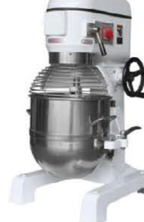
Model: B50B/B60B Food Mixer