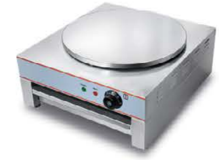
Model: HCM-1D / HCM-2D Single / Double Electric Crepe Maker (Shinning Surface)