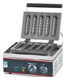
Model: EG-5X Crisp Machine (five parts)