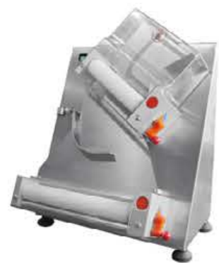
Model: APD30(Automatic) Pizza Dough Sheeter