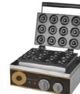
Model: HDM-12 Donut Maker