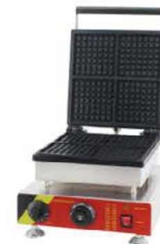
Model: HWB-114 4-Plate Waffle Maker