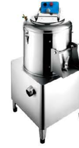
Model: PP15A/30A Potato Peeler