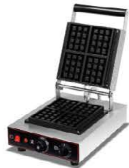
Model: HWB-1S 1-Plate Waffle Baker