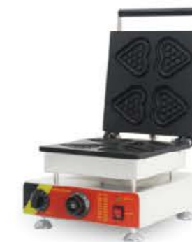
Model: HWB-4H Heart Shape