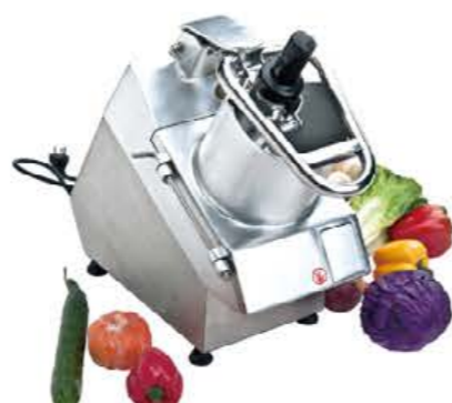
Model: VC-65MS Multi-Purpose Electric Vegetable Cutter