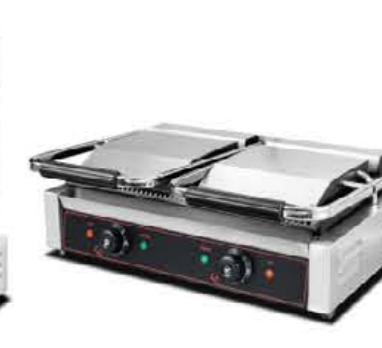
Model: HEG-813A (Down Flat) HEG-813EA (Down Flat) Electric Contact Grill