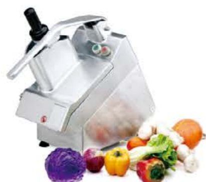
Model: VC-60MS Multi-Purpose Electric Vegetable Cutter