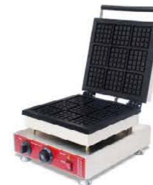
Model: HWB-119 9-Plate Waffle maker