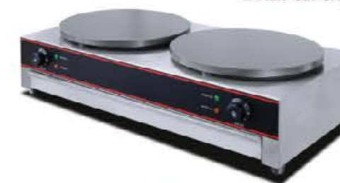
Model: HCM-2 2-Plate Electric Crepe Maker