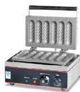
Model: EG-6X Crisp Machine (six parts)