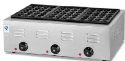
Model: HX-65 Electric 2-Head Fishball Grill