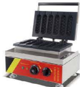
Model: EG-6D Crisp Machine