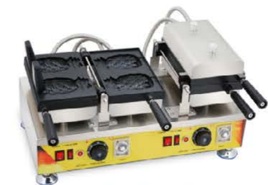
Model: FCS-1104P Pipeapple Taiyaki Machine