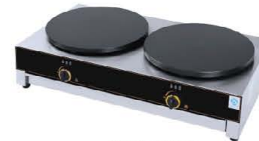
Model: HCM-2G 2-Plate Gas Crepe Maker