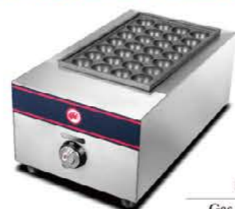
Model: HX-34R Gas 1-Head Fishball Grill