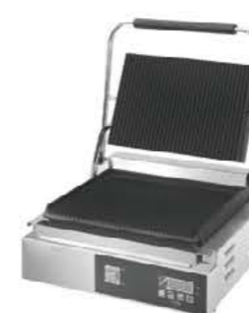
Model: HEG-811ET Electric Contact Grill (Touch-Screen Control)