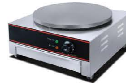
Model: HCM-1 1-Plate Electric Crepe Maker