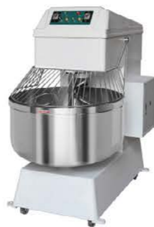
▲ HS200/HS260 Spiral Mixer