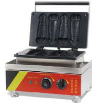
Model: BW-305 Gayke Penis Shaped Waffle Maker