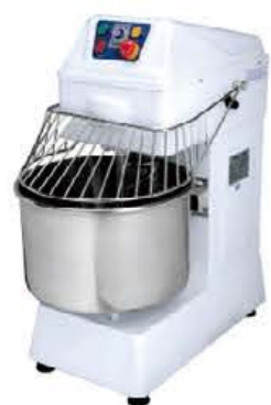
▲ HS20/HS30/HS40 Spiral Mixer