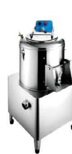
Model: PP8A Potato Peeler