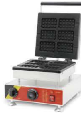
Model: HWB-6S Commercial 6pcs Square Waffle Machine