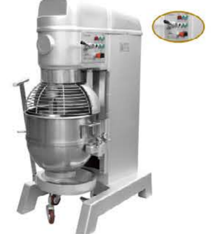
Model: B100K Food Mixer