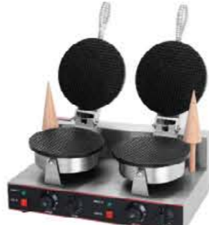
Model: HCB-2 2-Plate Cone Baker