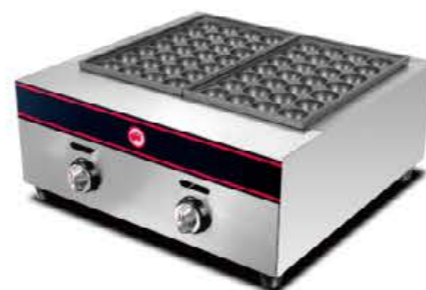
Model: HX-56R Gas 2-Head Fishball Grill