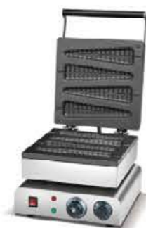
Model: ZH-118A Lolly Waffle Baker