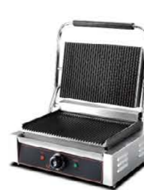
Model: HEG-811 / HEG-811E Electric Contact Grill