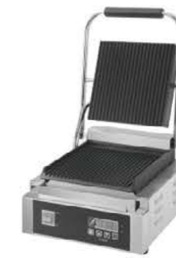
Model: HEG-811T Electric Contact Grill (Touch-Screen Control)