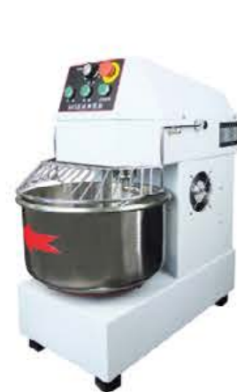
▲ FHS20A/FHS30A Frequency Conversion Dough Mixer