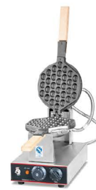
Model: HES-30 Electric Egg Waffle Baker