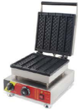
Model: HWB-4L Waffle Maker