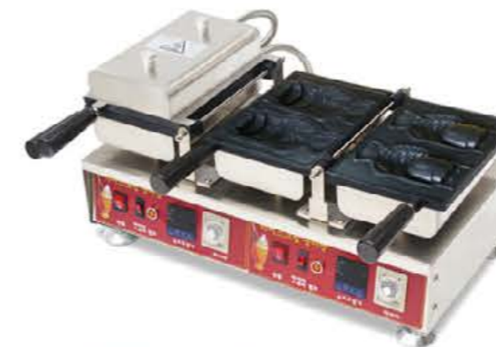
Model: FCS-1104B The Carp Waffle Maker