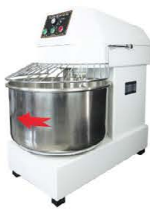
▲ BS-20A/BS-30A Spiral Mixer