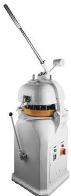
Model: FK-30 Semi-auto Rounder & Divider