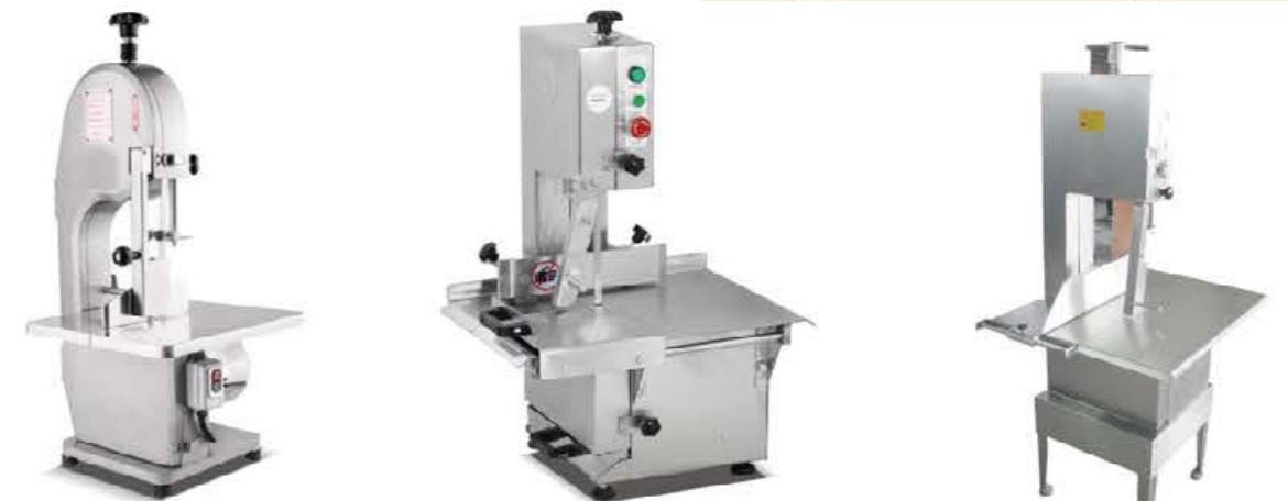
Model: JG-210P Bone Saw(Outside painting)