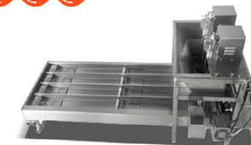
Model: HDF-480 4-Row Full Automatic Electric Donut Fryer