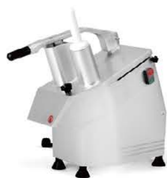
Model: VC-55MF Multi-Purpose Electric Vegetable Cutter