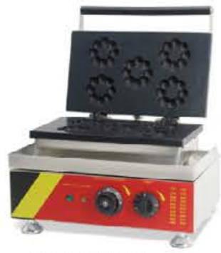
Model: BW-303 Flower shape donut maker