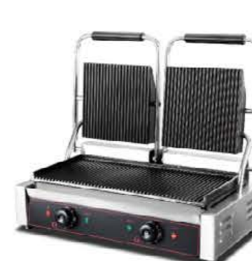
Model: HEG-813 / HEG-813E Electric Contact Grill