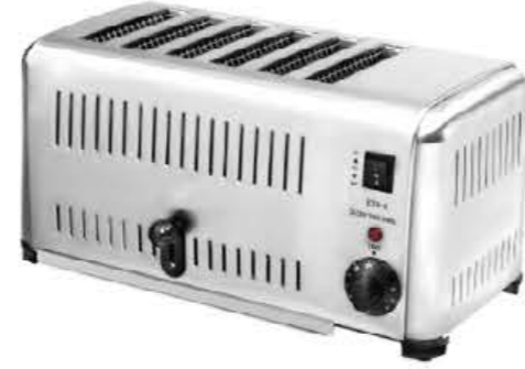
Model: HET-6 6-Slice Toaster