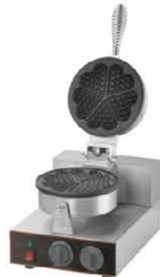
Model: HWB-1H 1-Plate Heart Shape Waffle Baker