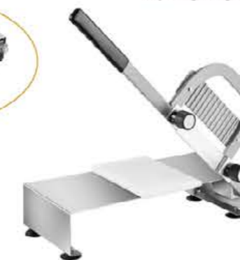
Model: JG-25 Wave Cutter Slitting Machine