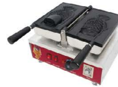
Model: FCS-1101 Taiyaki Maker