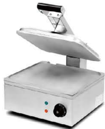
Model: HT-01 9-Slice Toaster (Sandblast Finish)