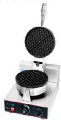
Model: HWB-1 1-Plate Waffle Baker