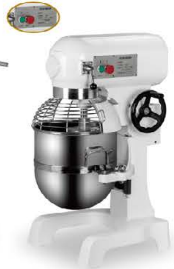
Model: B20K/B30K Food Mixer