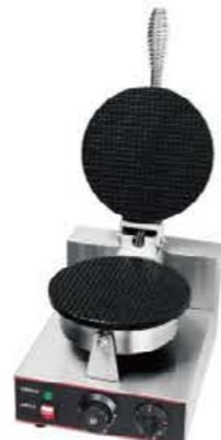
Model: HCB-1 1-Plate Cone Baker