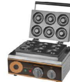
Model: HDM-6 Donut Maker