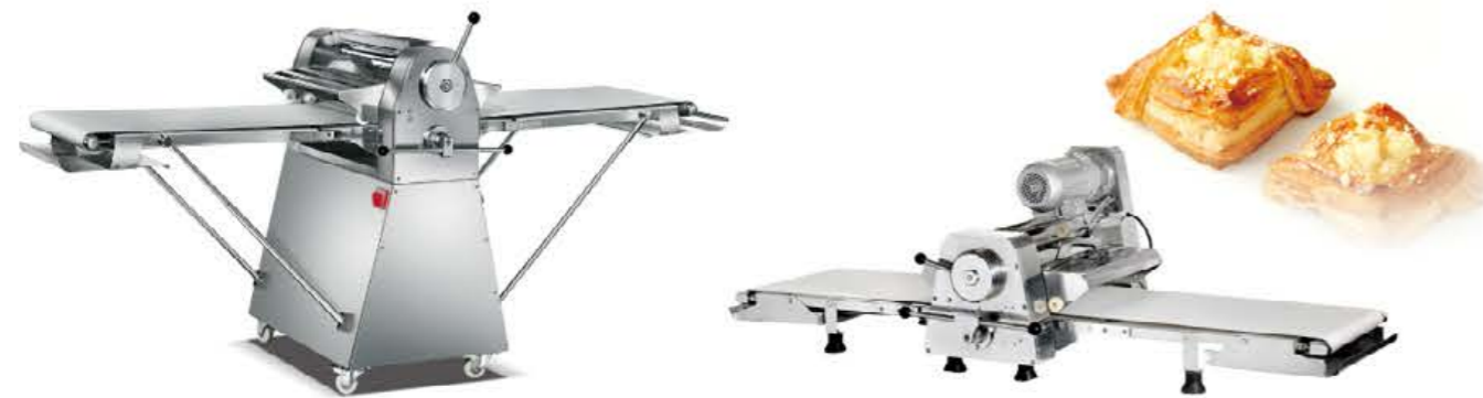
Model: LSP-400 / 520 / 650 Free Standing Dough Sheeter