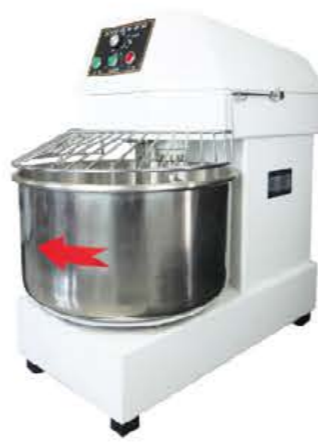
▲ BS-40A/BS-50A/BS-60A Spiral Mixer