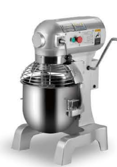
Model: B10K/B15K Food Mixer