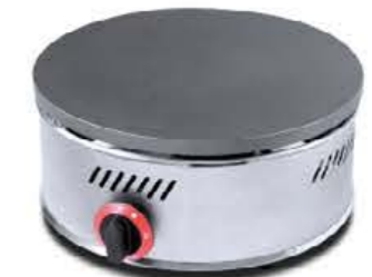
Model: HCM-400G 1-Plate Gas Crepe Maker