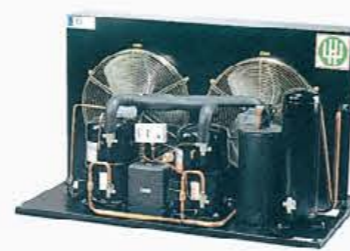
Totally enclosed condensing unit