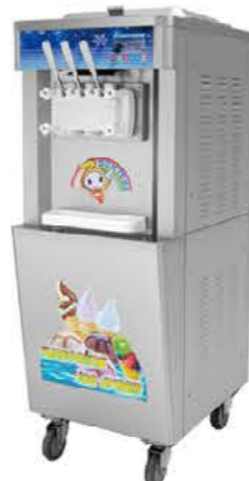
Model: BQL-P33 / 88