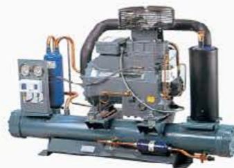
Ari-cooled condensing unit

Compressor Power: 0.75-700HP Evaporation Temperature: -50~-12.5°C Semi-enclosed Air-cooled Condensing Unit Refrigerant: R22/404A/507