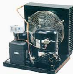
Totally enclosed condensing unit

Compressor Power: 0.75-700HP Evaporation Temperature: -50~-12.5°C Semi-enclosed Air-cooled Condensing Unit Refrigerant: R134A/407