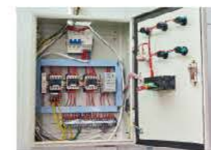
Combination Electric Box