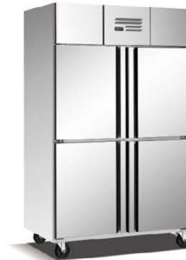
▲ KF-1210F / KF-1810F