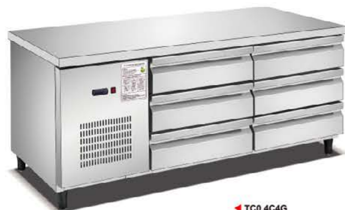
◀ TC0.4C4G Drawer Work Table