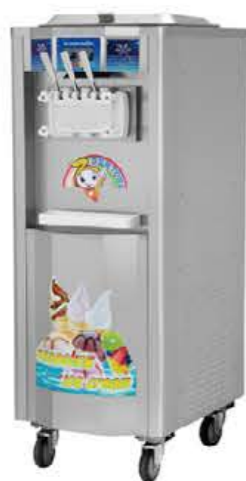
Model: BQL-P718 / 718P2