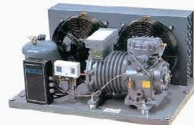
Water-cooled condensing unit