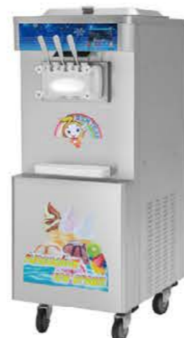
Model: BQL-P99 / P99A