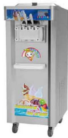
Model: BQL-P22A / BQL-P76A