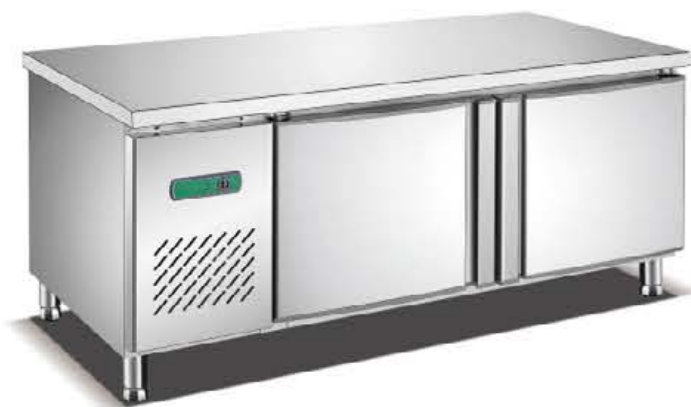
▲ HWT-1500 / HWT-1800