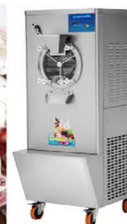
Model: BQL-HD20 / 30 / 40