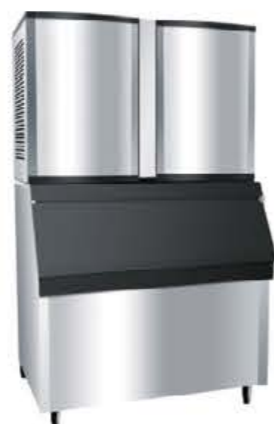
Model: SD-1300/ 1800