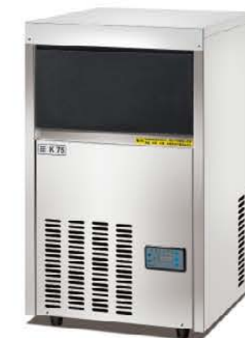
K75 / K125