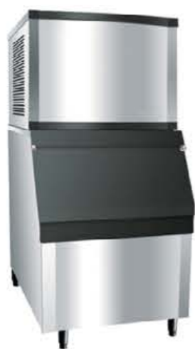
Model: SD-150/ 250/ 350/ 500/ 700/ 900