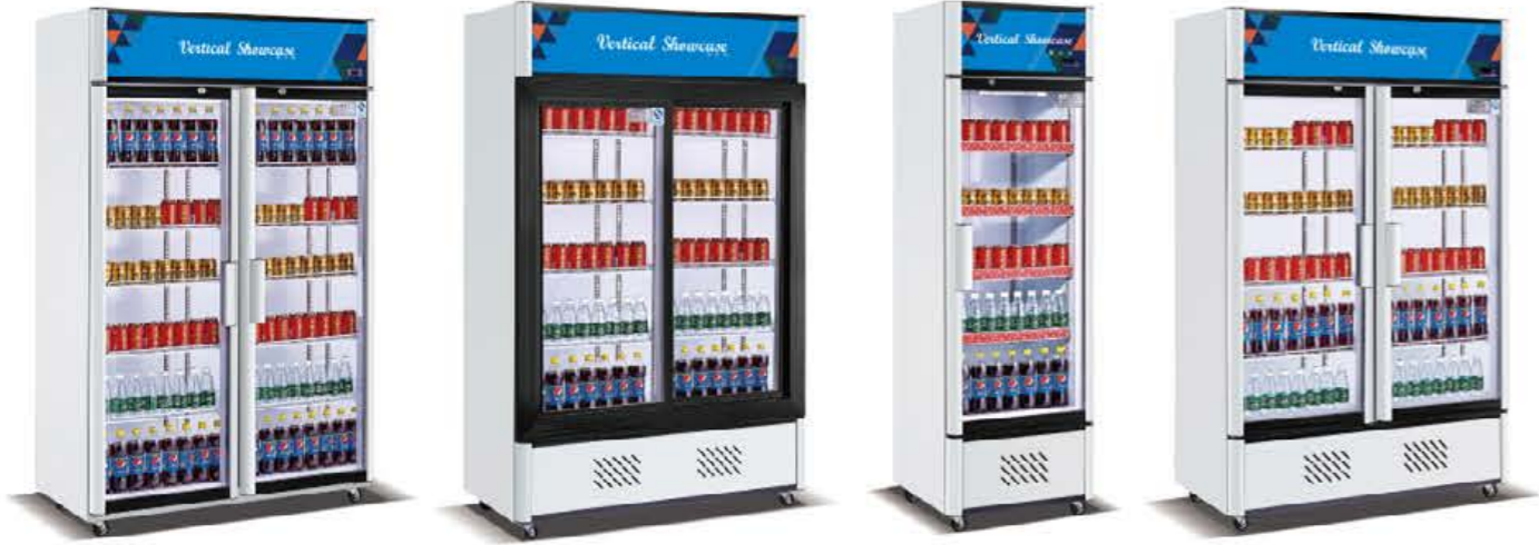
▲ HG-700A1 / HG-800A1