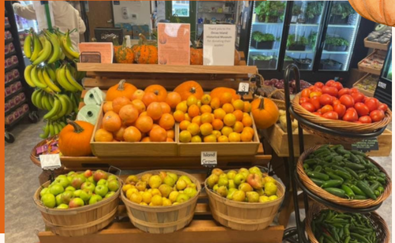
Inside our grocery model. Much of this produce is locally grown.

Pre-COVID, we were planning to expand the Food Bank's facility to better serve our customers. Early in 2020 the pandemic-related surge in demand made expansion urgent. Fortunately, grant funding and community support enabled us to quickly increase our staffing, hours of food distribution, and temporary storage areas for food (dry, cold, and frozen) and equipment.