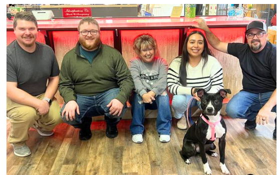
Identification's sponsored Angel

Can't adopt, foster or volunteer? How about donate to help support the shelter pets? Scan the QR code and donate today!