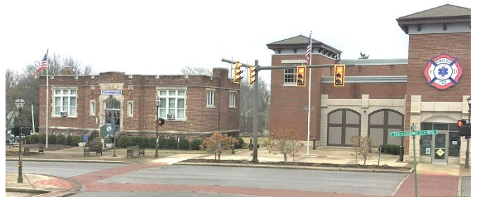
↑ Our Historical Museum's new look! Gone is the large tree with leaves, fruit, and roots that was slowly destroying our 100+ year-old building!