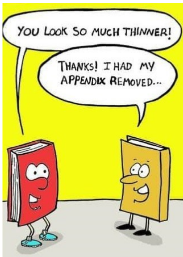
A little Historical Society humor to brighten your day!