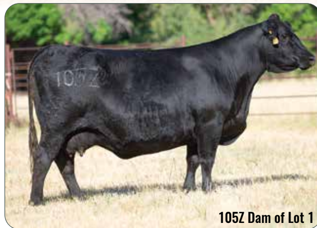
105Z Dam of Lot 1

318K ranks right with the best that we have ever offered for sale, and with good reason. We consider his sire to be one of the most influential herd bulls in our programs history and his mother is without question a top donor female. We could only hope that mating the two would result in what this Lot 1 bull represents. Not everyday can you pack that much muscle and power into such a stylish package. At the National Show in Oklahoma City he was admired by many for his phenotypic excellence, but elevated his worth scanning with over a 16 inch ribeye and over a 4 on his IMF at less than 10 months of age. They don't come any more herd bull ready, he is a breed changer! Retaining 1/2 semen interest.