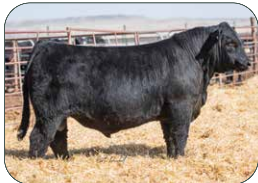
MJB Partiot 342H Owned with Deichmann Cattle Company Maternal Sib to Lot 30