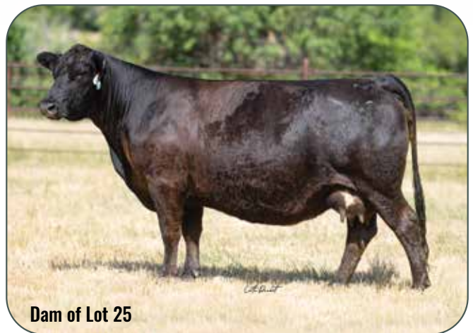
Dam of Lot 25

Heifer Bull. So much to love about this bull and his pedigree. His dam is arguably our most proven cow in terms of mating flexibility. It has not mattered how we breed her, it works. As a result, taking her to Smokescreen was a no brainer. The bull himself is one impressive individual. If you want one that will keep mature cow size more moderate but push down the scales on a set of feeder calves, then here he is. As unique in his strenghts as any bull we have ever sold. Come study this one. Mother is a Gold Dam.