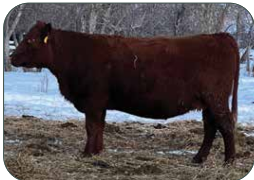
Dam of Lot 30

Here is one of the long bodied, smooth made bulls that transitions from a nice shoulder into a big top and expressive stifle while taking a long stride.