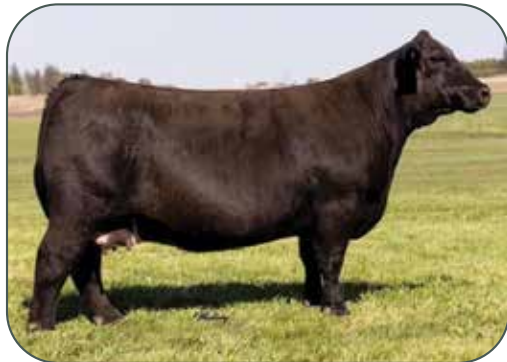
Maternal Sib to Game On 354G

MJB Game On 354G. This bull has a pedigree loaded with maternal strength. He is sired by our high marbling herdsire MJB Manning 342C who goes back to a Gold Dam, 120W. On the bottom side of Game On's pedigree is his dam 1127Z who traces back to some of our all-time great cows like 66N and 27N. 1127Z got things going with her very first heifer calf being a high seller and going on to be a donor for Weis Cattle in Iowa. Negative BW with WW, YW and Marbling in top 10%, Milk in top 30%.