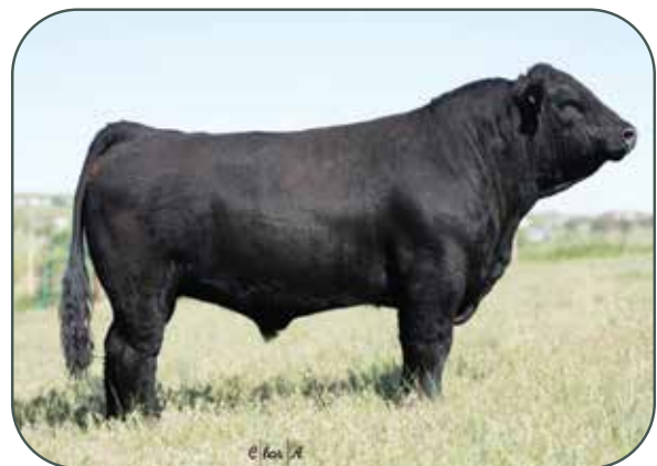
MJB Manning Maternal Sib to Lot 15