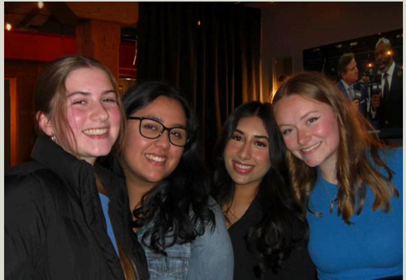
Events team at trivia night!

As a team our favourite memories have been seeing our events come together. The event that comes to mind would be FOSSA Formal. We started planning everything for formal in December and continued planning all the way until the day of. Seeing everyone being able to have so much fun at the events was truly the biggest reward. Something that being on FOSSA has taught all of us would be organization. Organization is key, especially on the events team. We learned how important organization was from the get-go this year, while planning O-Day (it was rough). But, with much trial and error, by the winter term we found our rhythm. Our advice for any future execs would be to learn through error.