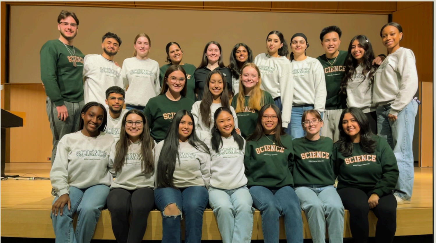
The Team at Our Chris Hadfield Event!

something greater than yourself! By the end of the year, you'll realize that all of your hard work has made a positive impact on our science community.