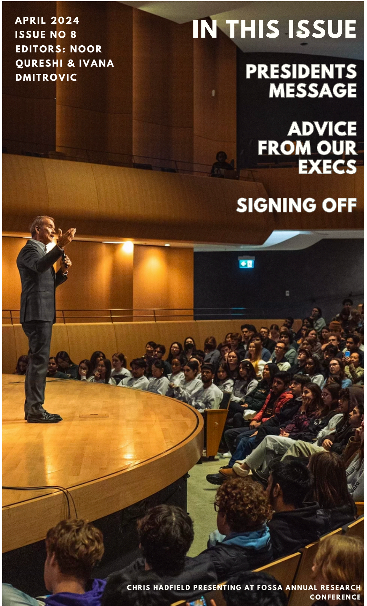
CHRIS HADFIELD PRESENTING AT FOSSA ANNUAL RESEARCH CONFERENCE