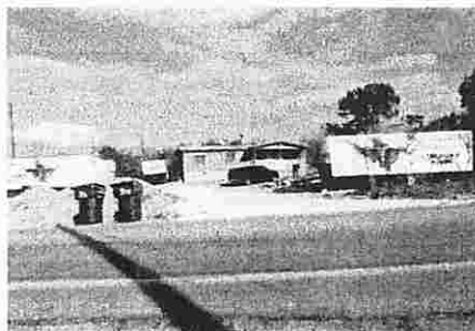
Longhorn Moving Company

We live on the north end of Hudson Bend Road and our property values are increasing. There are many neighbors dedicated to holding the line against commercial operations like those filling the lots on the south end of Hudson Bend where there are no restrictions.