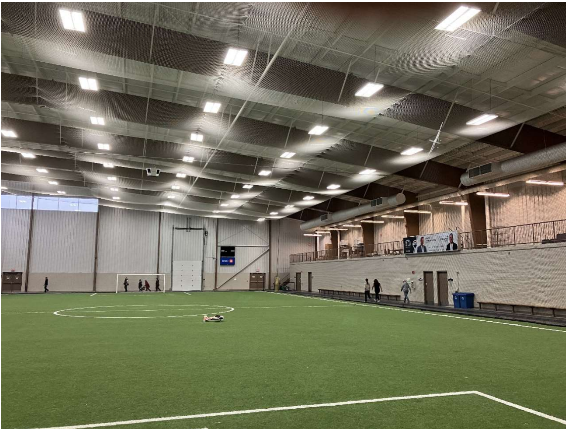
Think I'll convert my 35% to electric for indoor. Lots of room