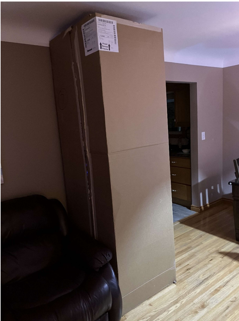
Speaking of big boxes for Christmas Hmm!