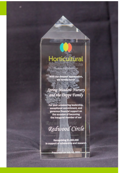
Dale Deppe, Spring Meadow Nursery, is inducted as the first-ever member of the Redwood Circle, having donated $1 million to HRI.