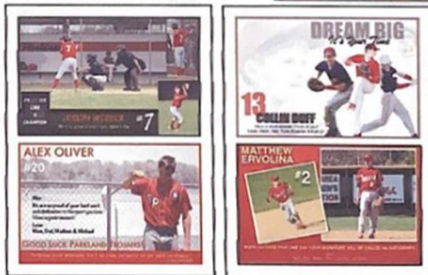
Sample Half Page Player Ads

PLEASE CONTACT The Booster Club BY MARCH 31 IF YOU WOULD LIKE TO PARTICIPATE