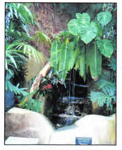
Your Name Here