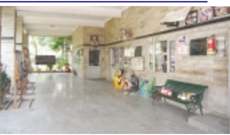
Administration Block, Moti Nagar