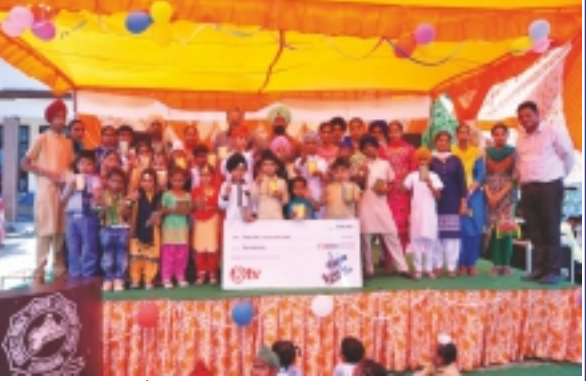
ਤੀਜ ਦੇ ਮੌਕੇ ਤੇ ਤਿਆਰ ਵਿੱਧਿਆਰਥਨਾਂ