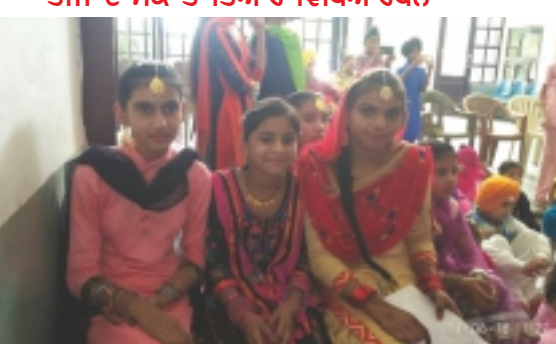
ਇੱਕ ਨਾਟਕੀ ਝਲਕੀ ਪੇਸ਼ ਕਰਦੇ ਵਿੱਦਿਆਰਥੀ