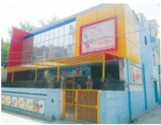
Outside view of Ranjit Park Playway

where our students, the tiny tots are able to meet challenges that would never seem too easy to achieve for other people. 'DEVELOPMENT O F HUMAN BEINGS ?