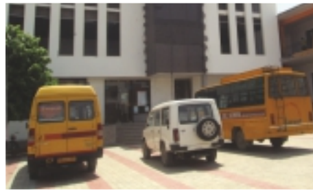
Own Buses, Quality Drinking Water & Soon coming solar Lighting