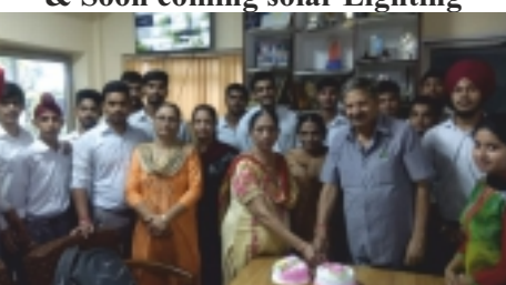
Respectable Teachers at Everest