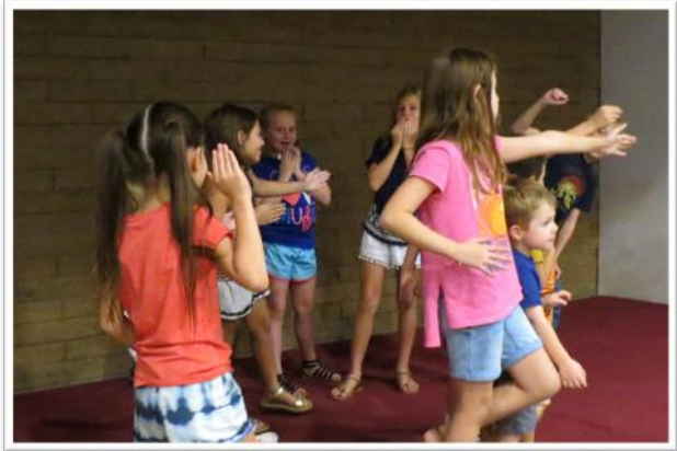
Students recreate key moments of OXI Day.