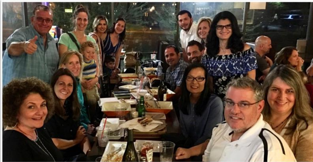
At George's Kitchen, 16th St & Bethany Home Rd