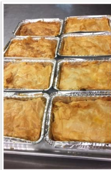
Makaropita before and after.