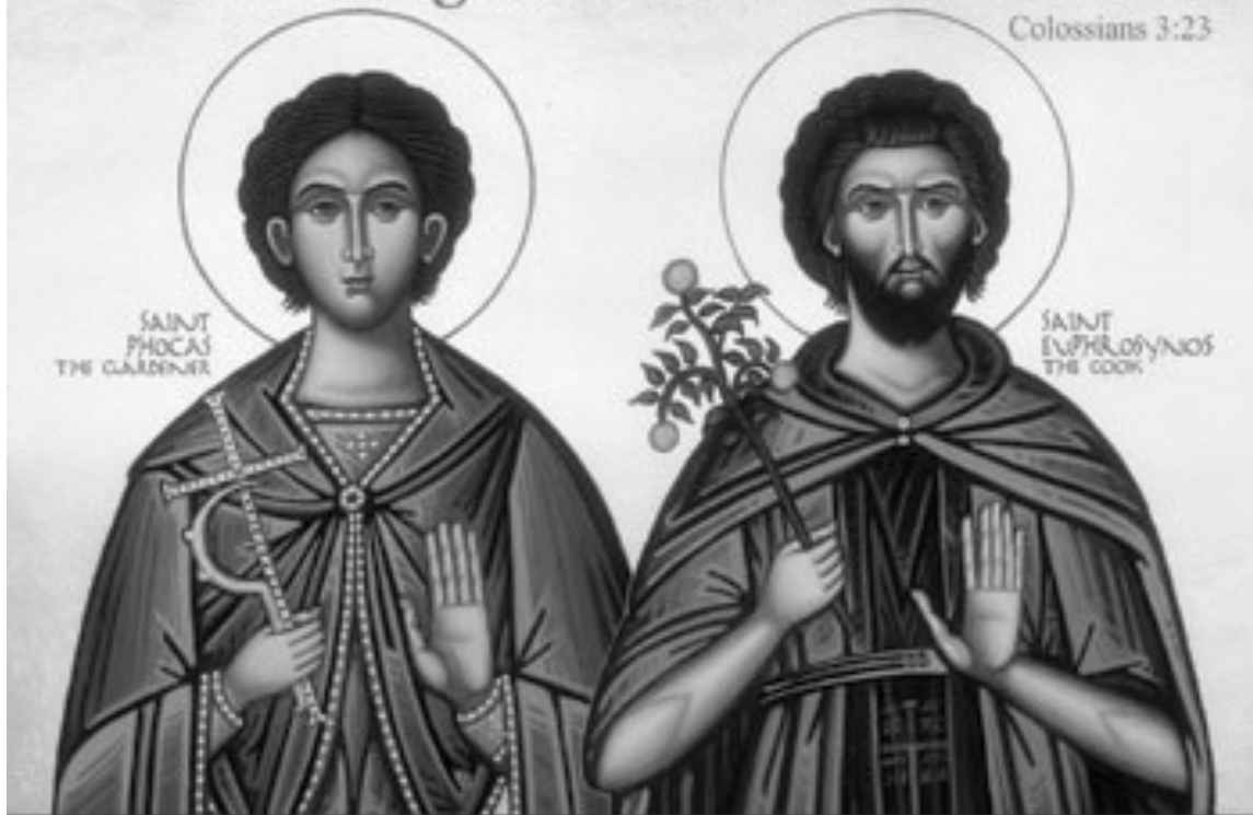
SAINT PHOCAS THE GARDENER