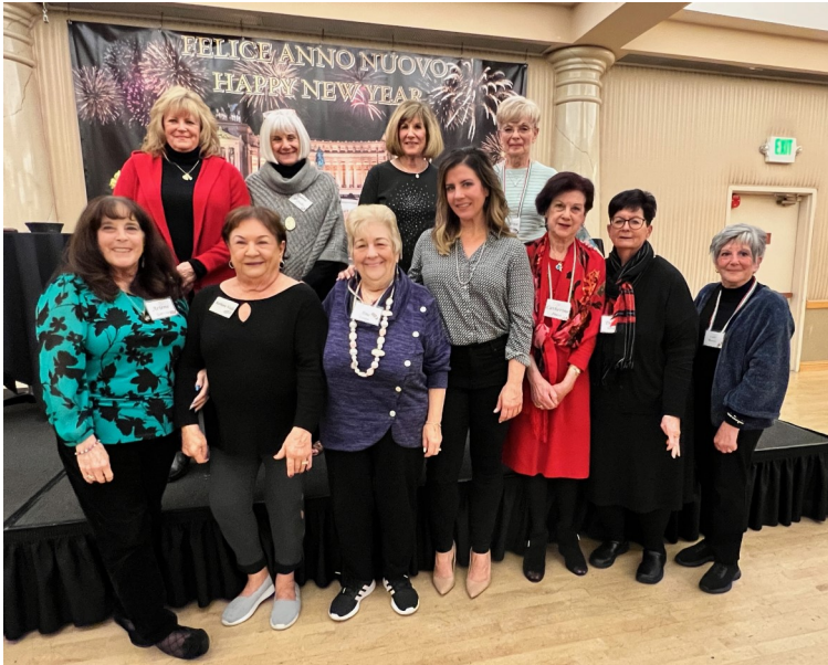
2023 OFFICERS AND BOARD OF DIRECTORS