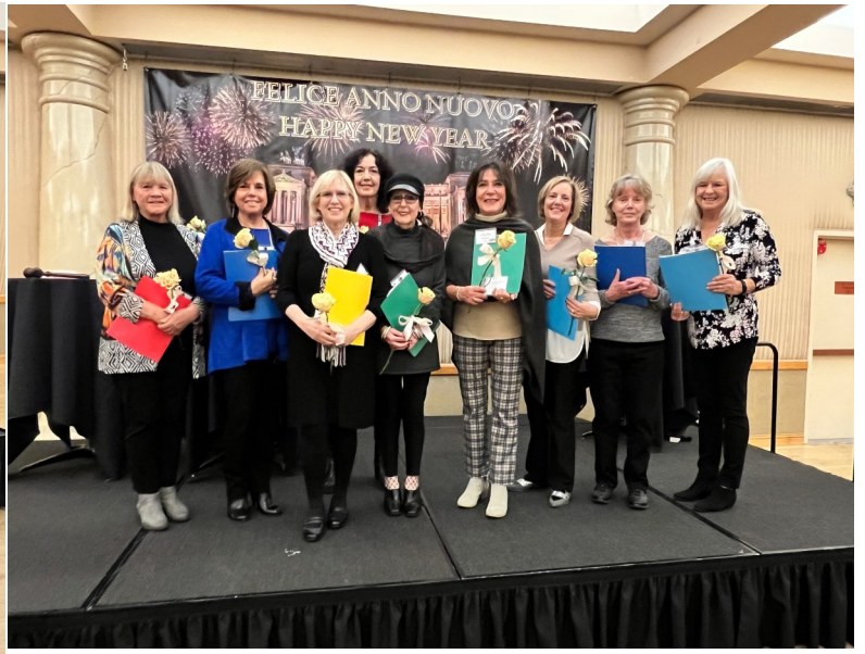
2023 JANUARY NEW MEMBERS!