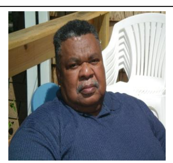
President Cleveland Kurtz

and very much present. But as a consumer of the music I did not have the perspective, point of view, or vantage point of the musicians that made it all happen.