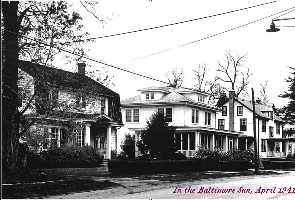
In the Baltimore Sun, April 1941