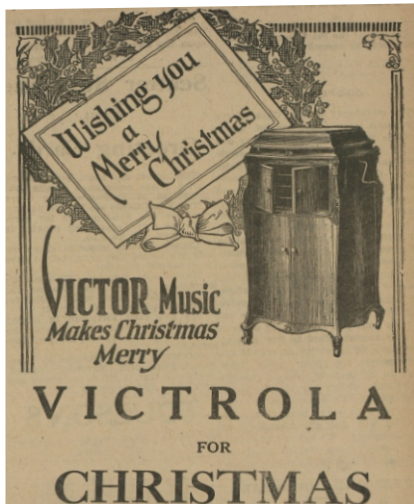
The Chestertown Transcript, December 1923

A grant application was submitted to Chesapeake Bay Trust for the construction phase of the Division Street Project last February. While we were not an award recipient from them, our application was forwarded to the Maryland Department of Natural Resources. We were informed that our project was submitted with their application to the EPA for funding under the Infrastructure Investment and Jobs Act. On September 1st we were offered a grant in the amount of $326,040 from federal funding through MD DNR. We are still waiting on final plans for this project but will be moving forward in the coming months.