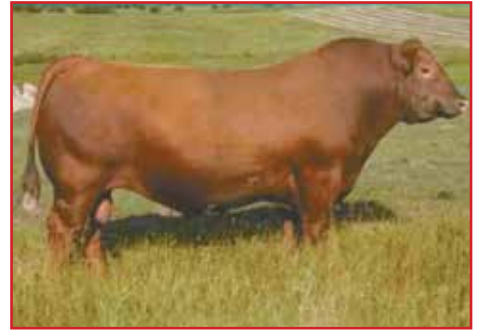
PFFR CONVOY 9Z // PB RED ANGUS RA# 1824309 // SIRE TO LOTS 24-26, 60, 61