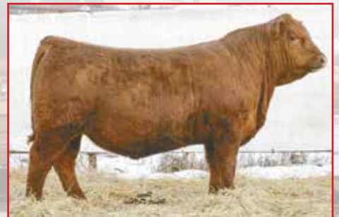
GW COPPERHEAD 919G // 1/2 SM 3/8 AR 1/8 AN ASA#: 3549340 // SIRE TO LOTS 19 & 20