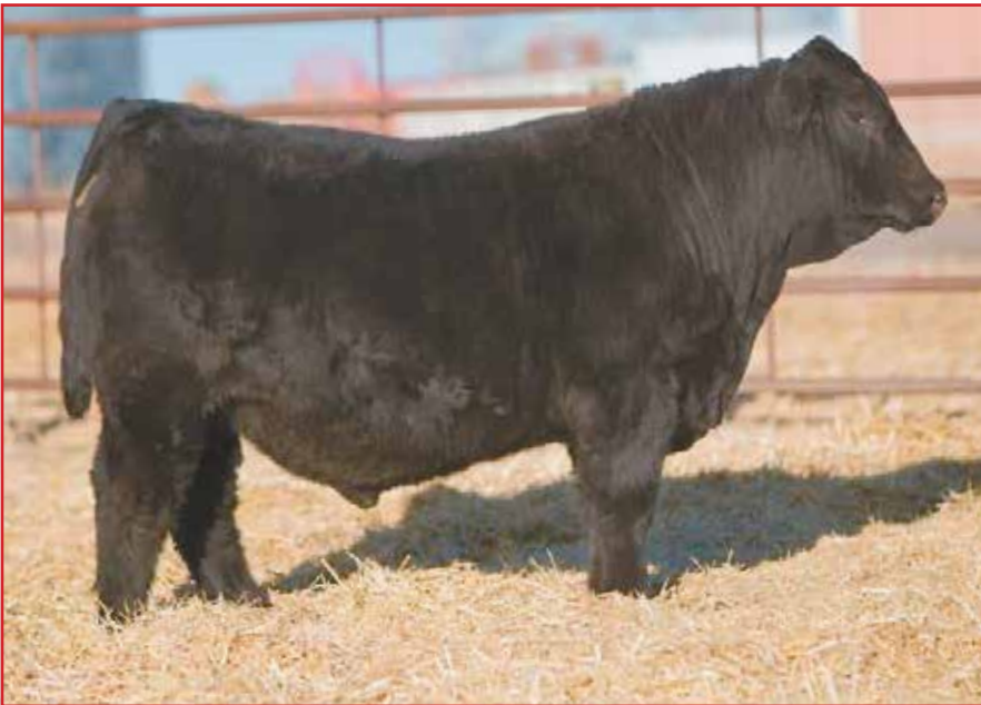
CDI MAJOR IMPACT 280H // PB SM ASA# 3801544 // SIRE TO LOTS 9, 10, 52, 57