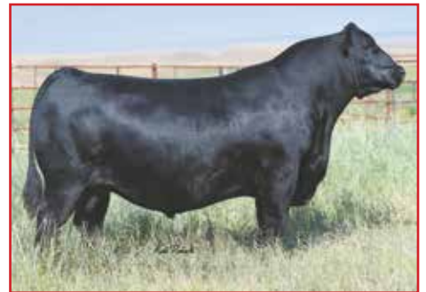
TEHAMA PATRIARCH F028 // PB ANGUS AAA# 18981191 // SIRE TO LOTS 44-47