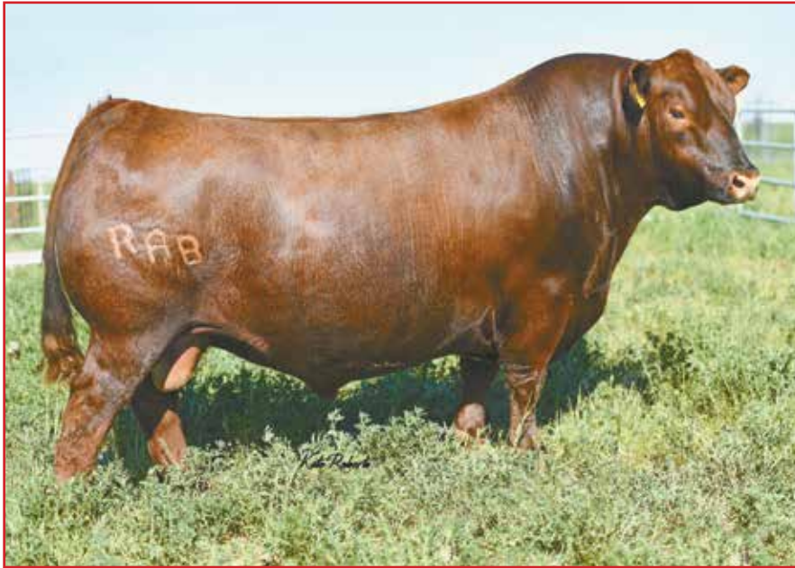
BIEBER CL ENERGIZE F121 ARAA# 3958815 // SIRE TO LOTS 27, 28, 65