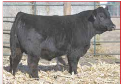
3C PASQUE 4702B B // PB SIMMENTAL ASA# 3852801 // SIRE TO LOTS 12-15, 50 & 58